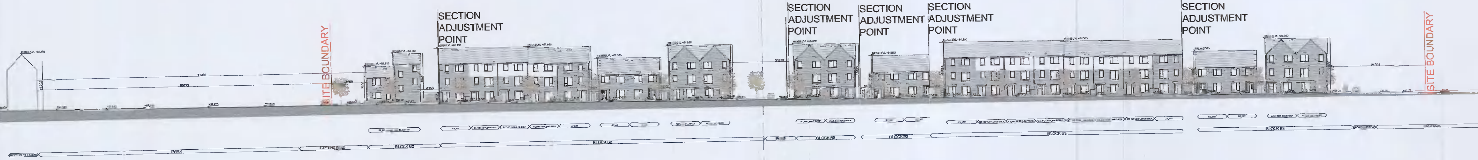
1 PROPOSED CONTIGUOUS ELEVATION E-E Part A 1:200 0209