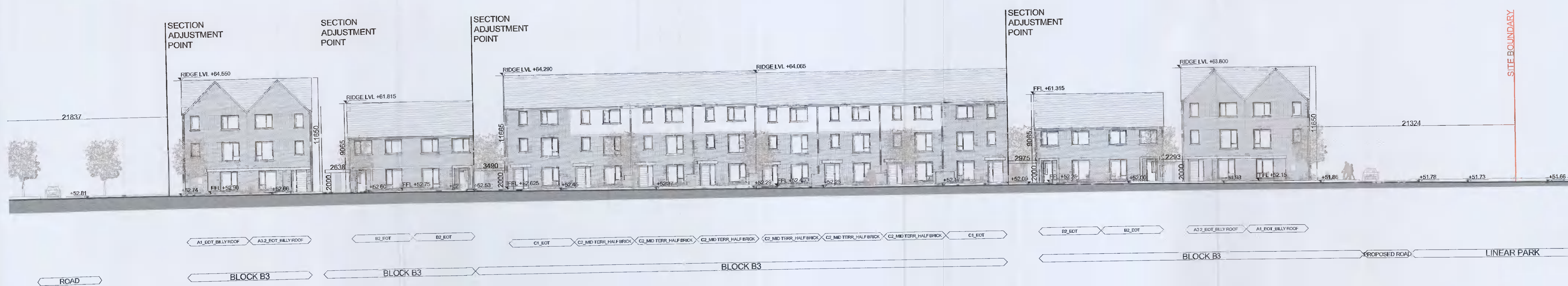
3 PROPOSED CONTIGUOUS ELEVATION E-E Part B 1:200 0209