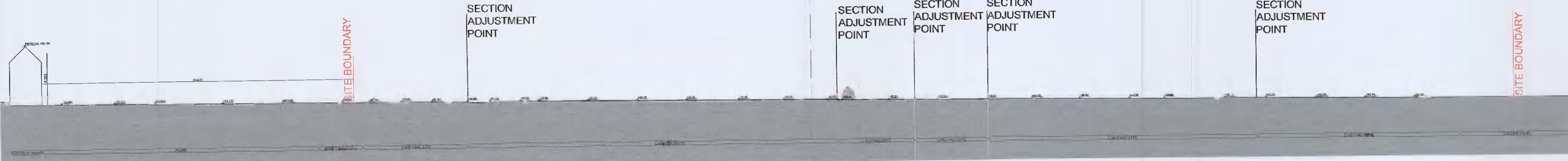
1 EXISTING CONTIGUOUS ELEVATION E-E Part A 1:200