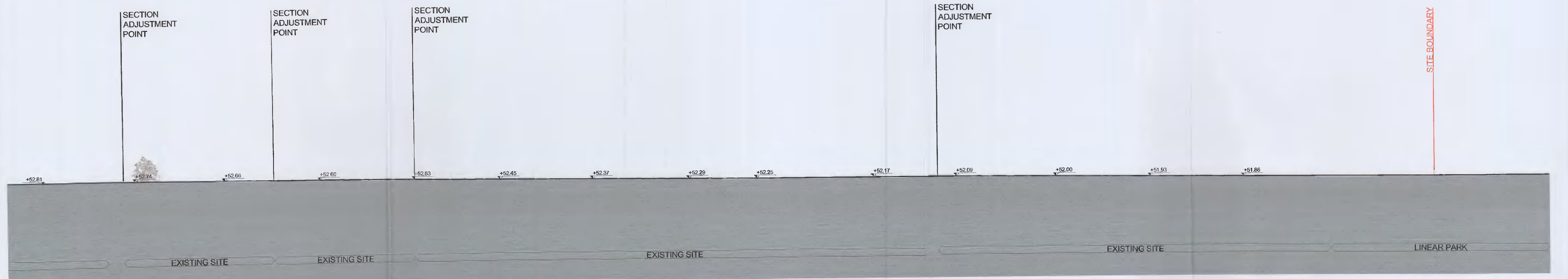
3 EXISTING CONTIGUOUS ELEVATION E-E Part B 1:200