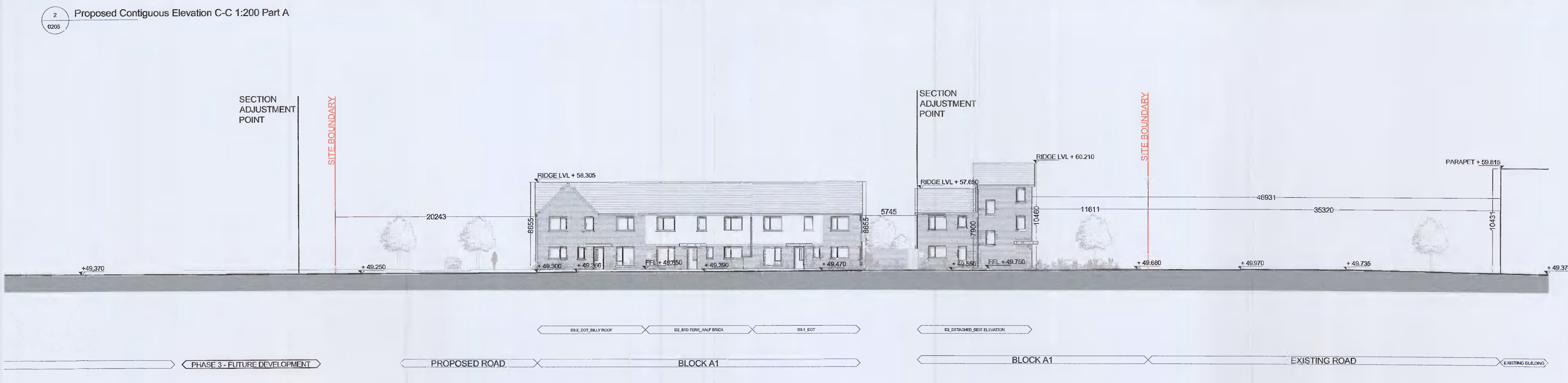
2 Proposed Contiguous Elevation C-C 1:200 Part A 0205