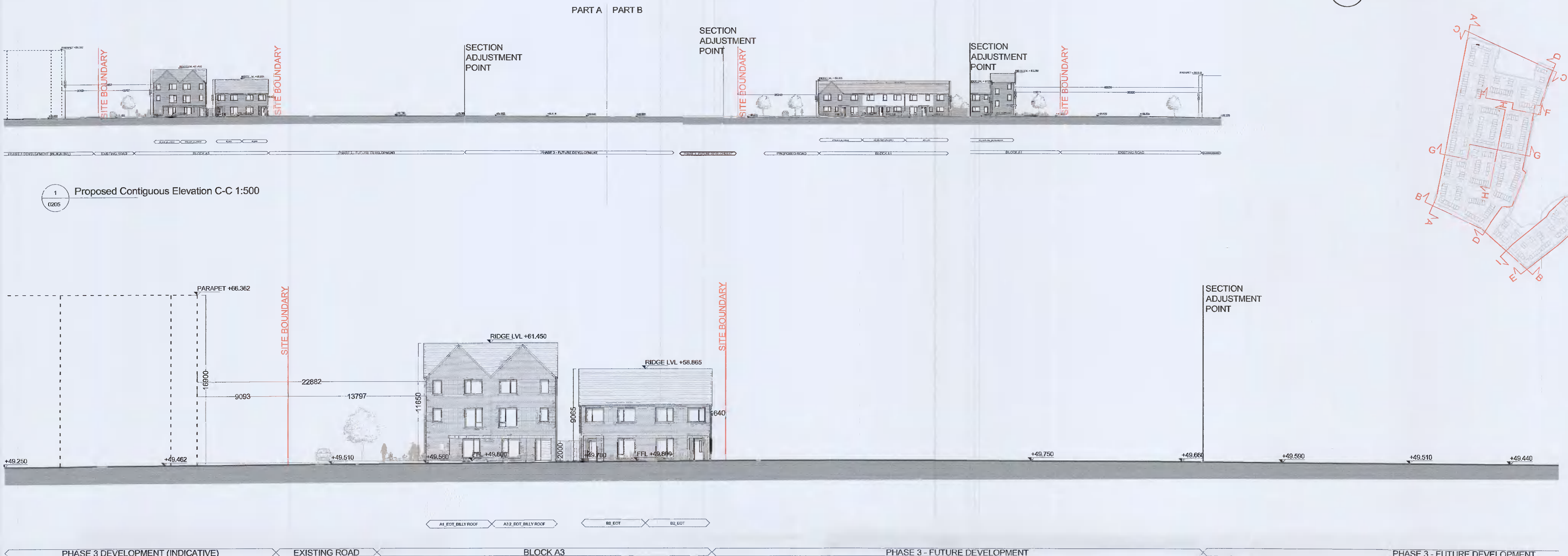
1 Proposed Contiguous Elevation C-C 1:500 0205