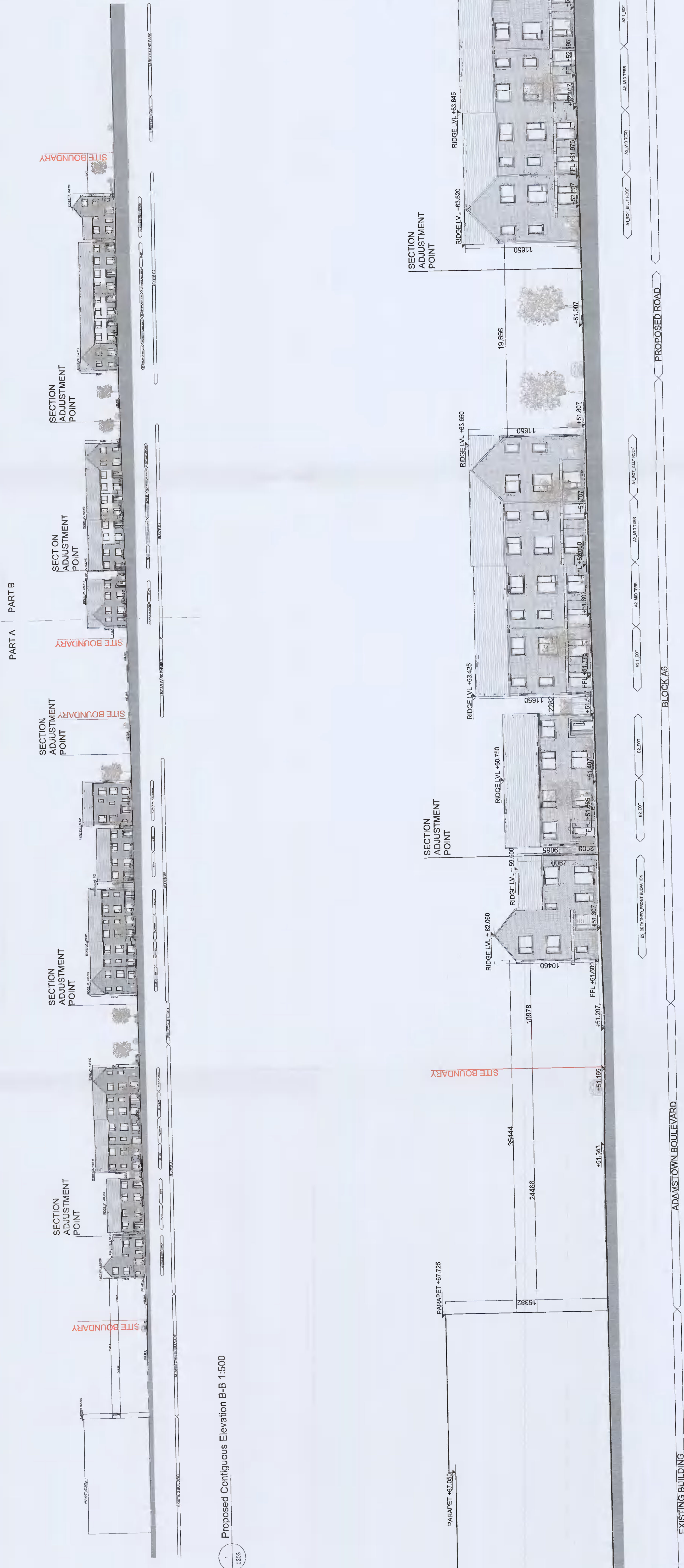
1 Proposed Contiguous Elevation B-B 1:500