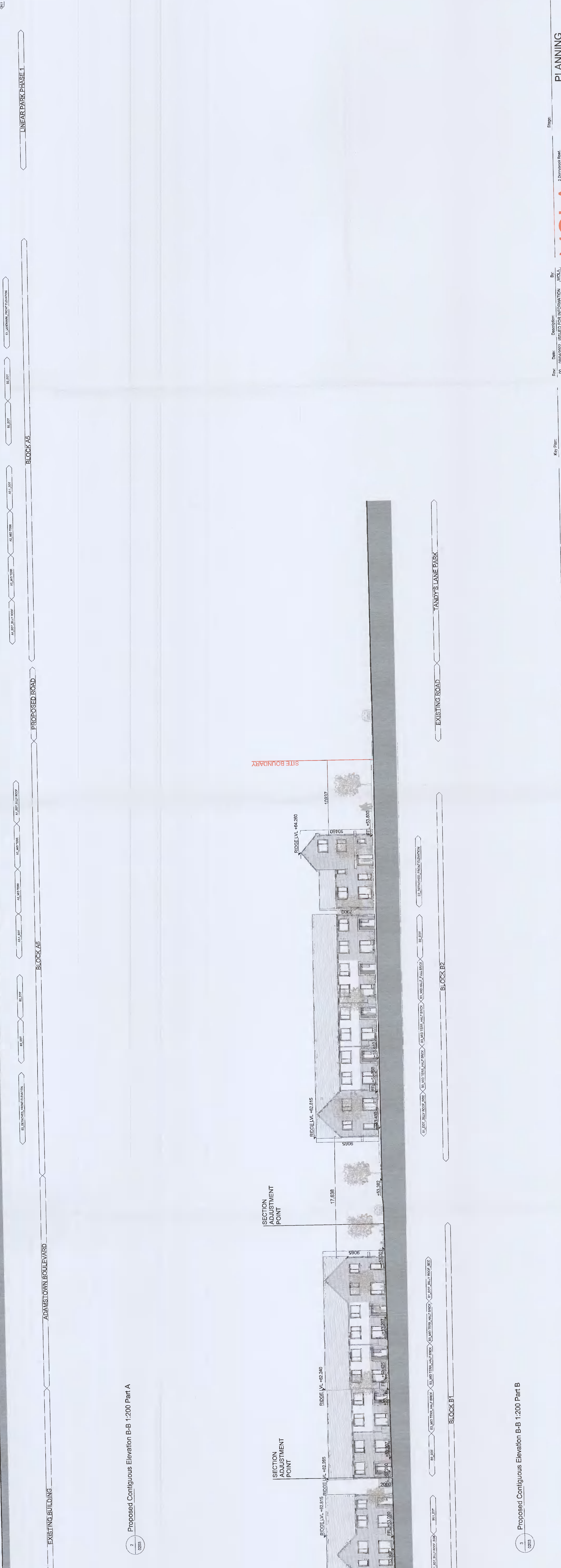
2 Proposed Contiguous Elevation B-B 1:200 Part A