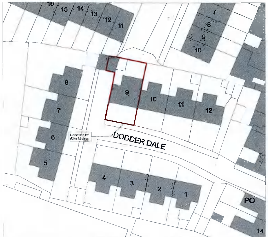
SITE BLOCK PLAN SCALE 1 : 500