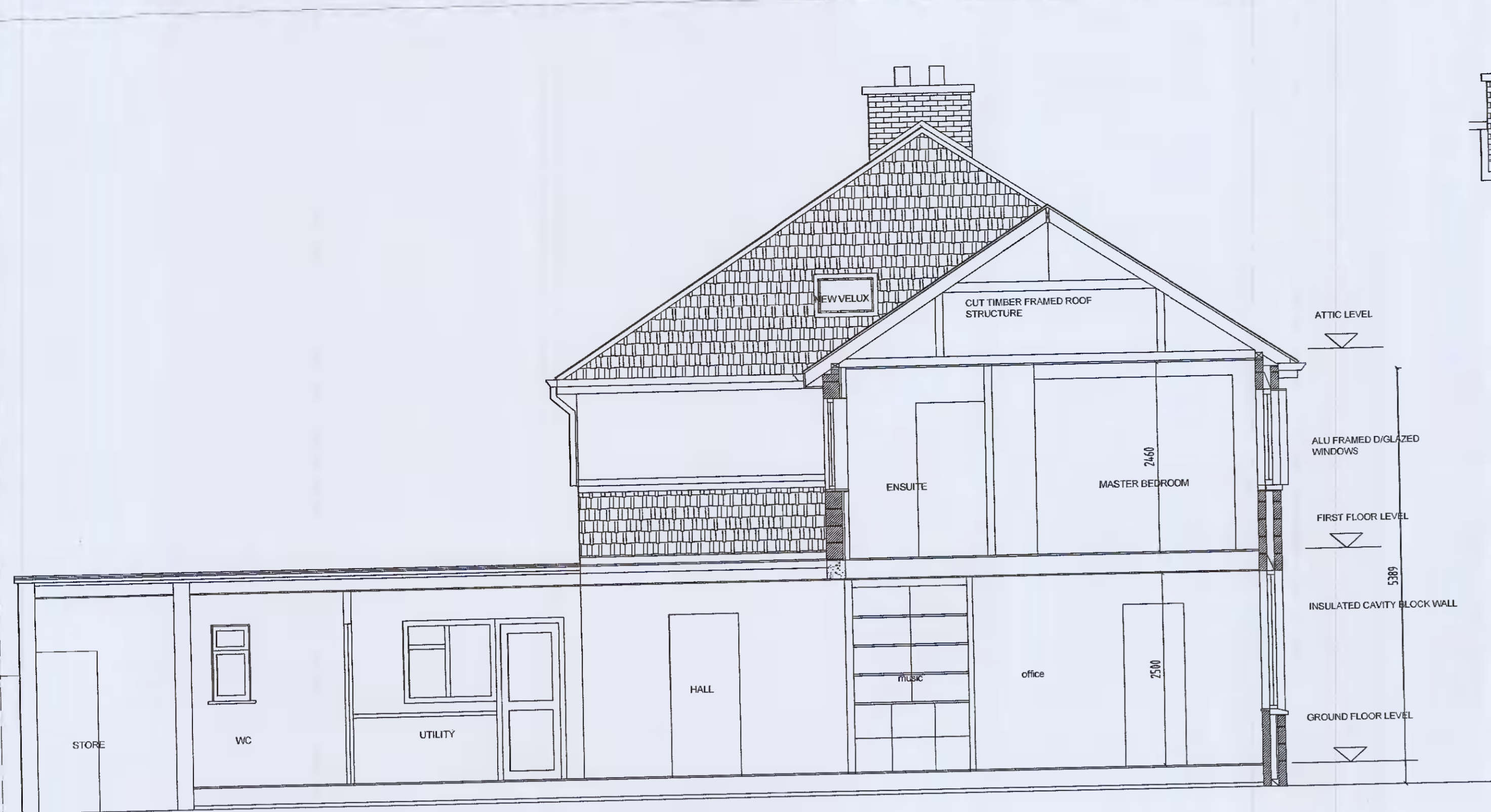
PROPOSED SECTION BB