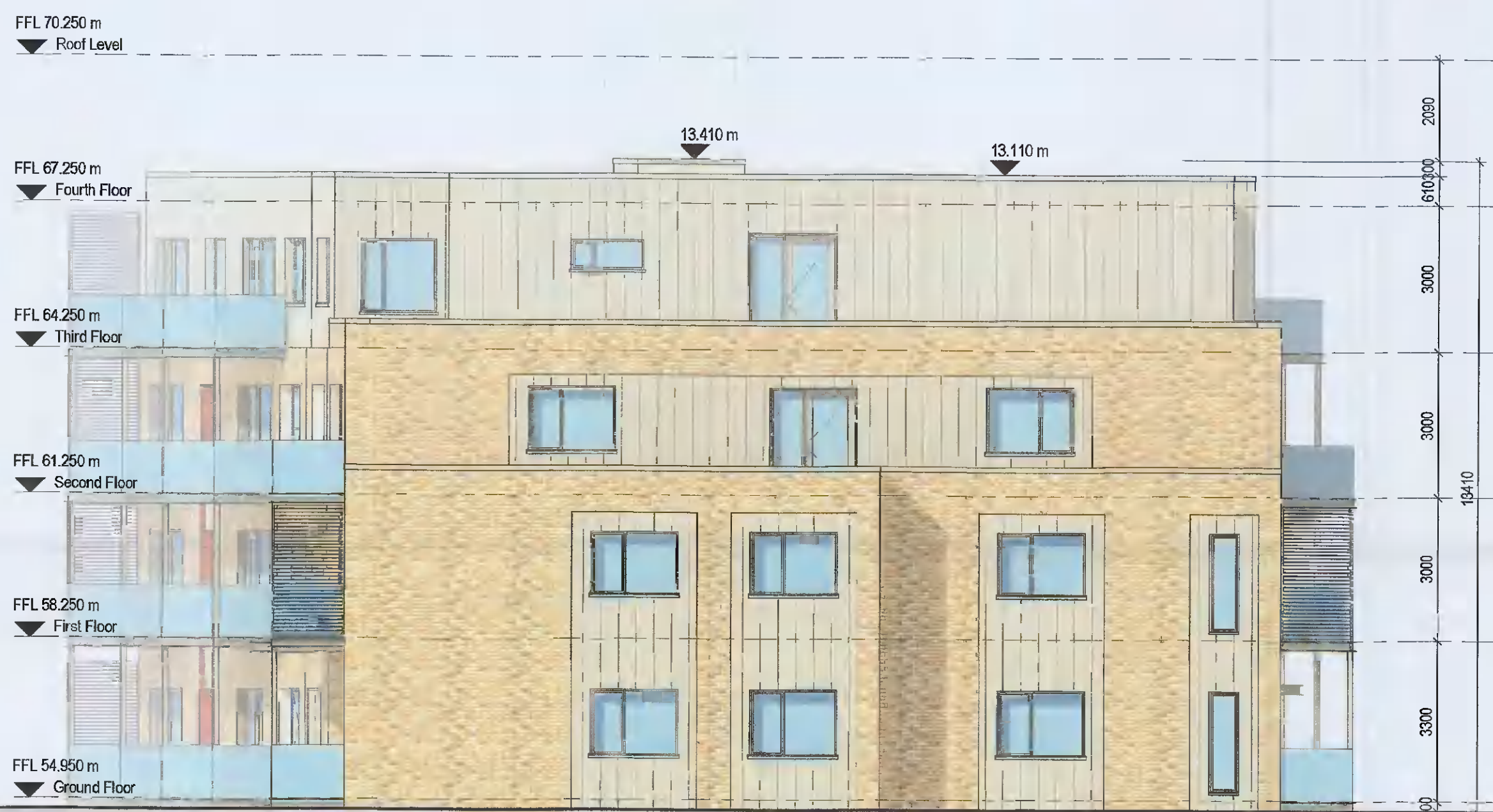
BLOCK 3 WEST ELEVATION FACING HAYDEN'S LANE 1 : 100