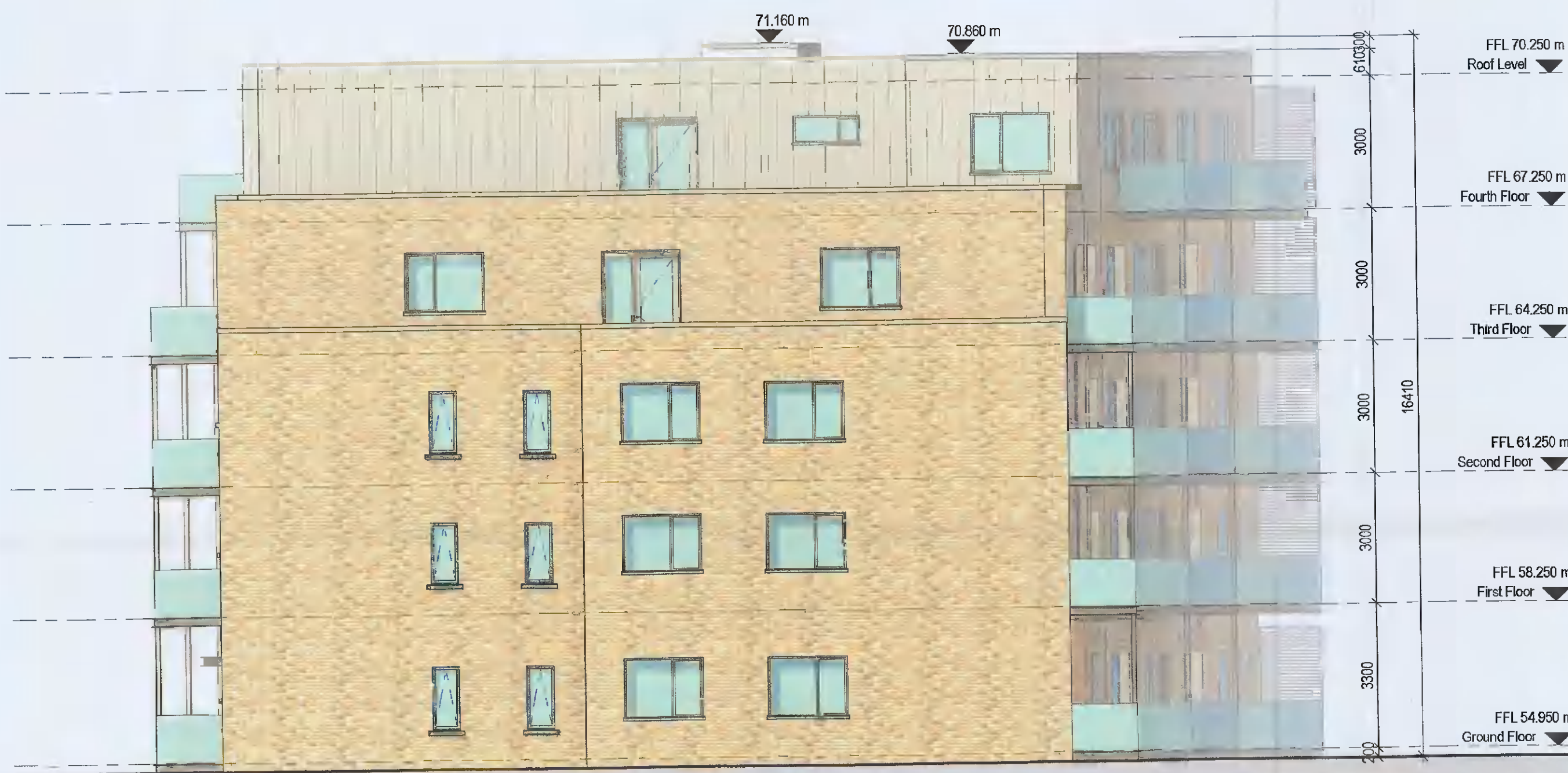
BLOCK 2 NORTH ELEVATION FACING BLOCK 1 1 : 100