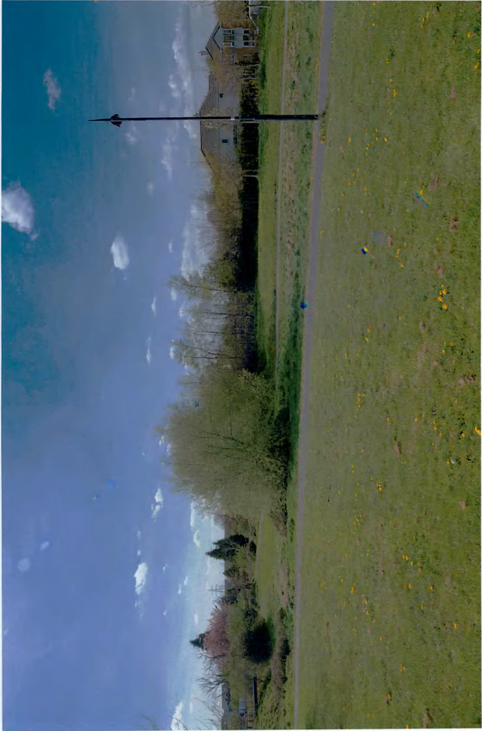
Verified Planning Photomontage