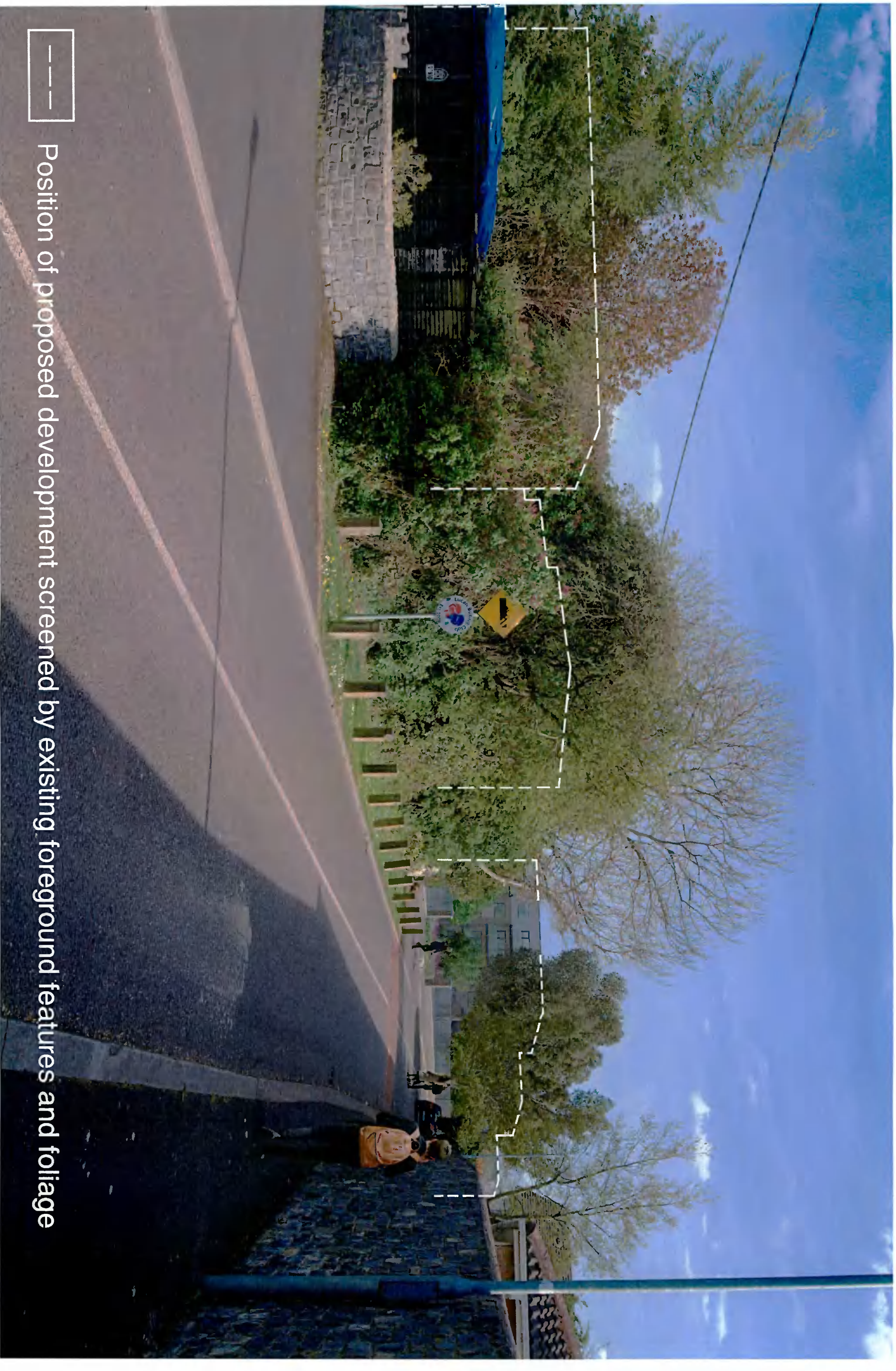
----- Position of proposed development screened by existing foreground features and foliage