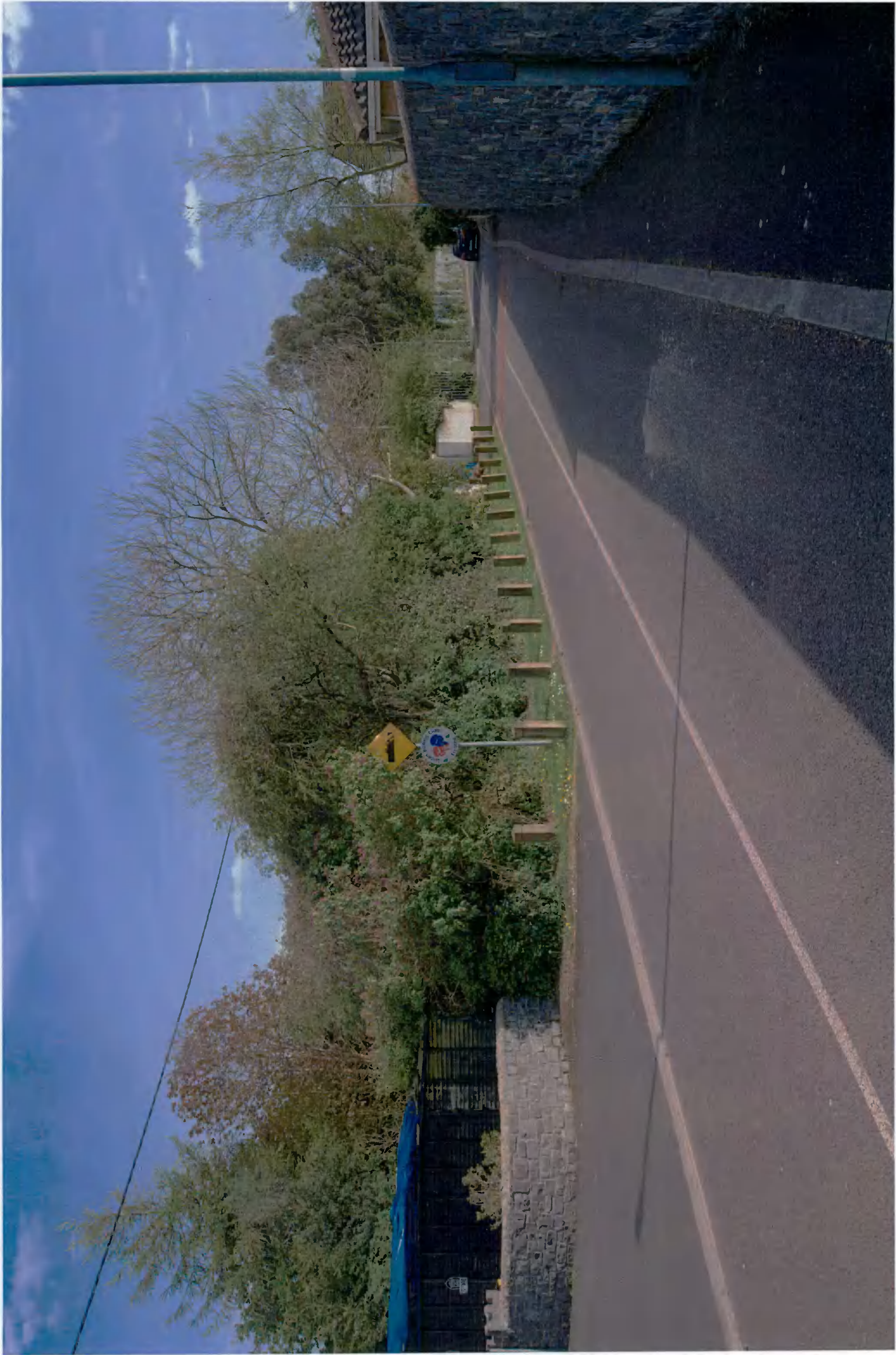
Verified Planning Photomontage