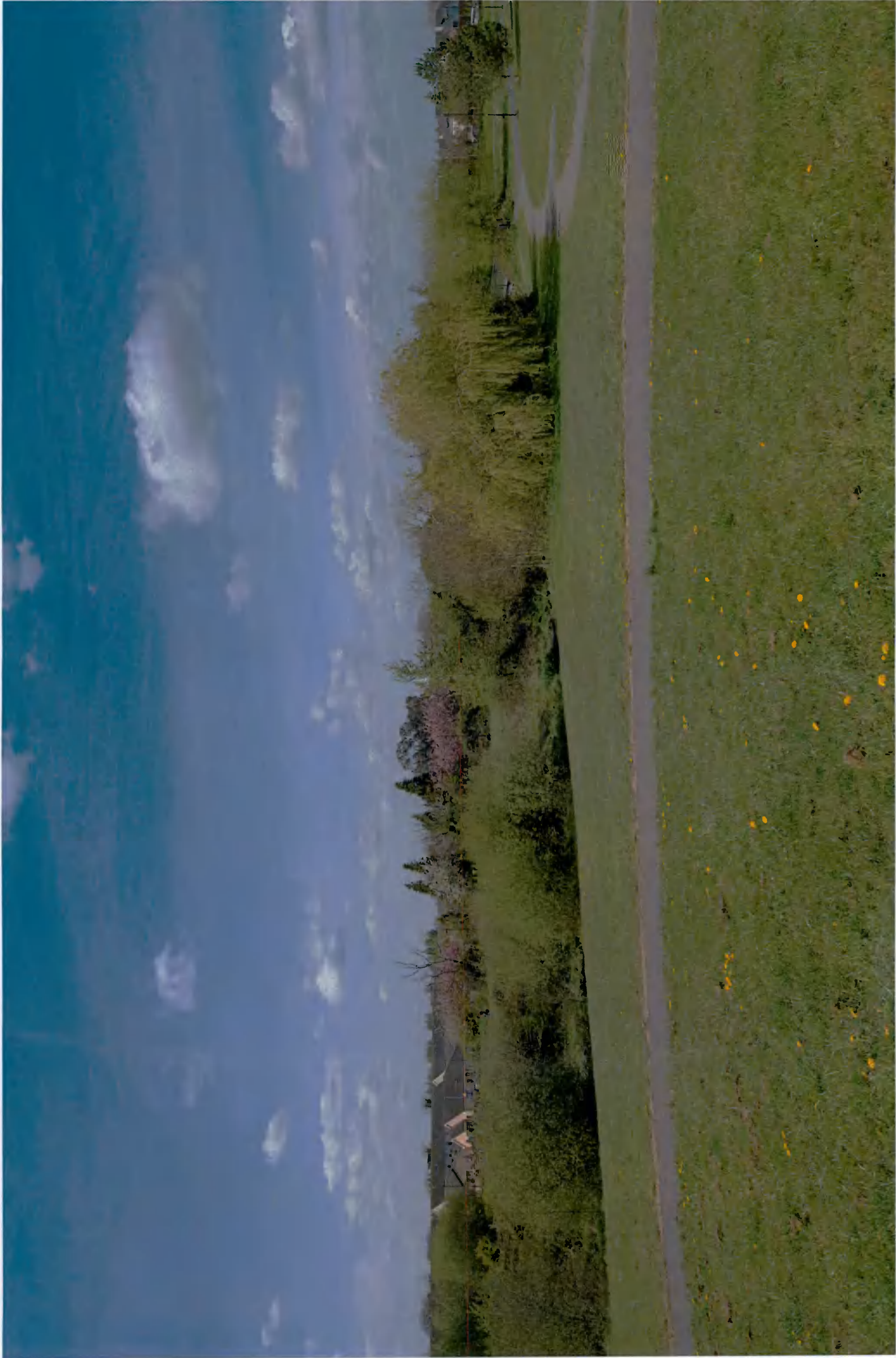
Verified Planning Photomontage