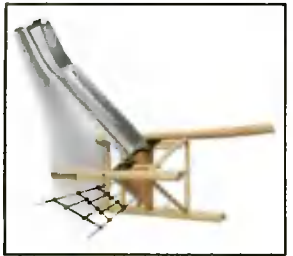
2: Tower with slide Provider: Kompan or similar Age Group: 3-8 Materials: Robinia treated wood & steel