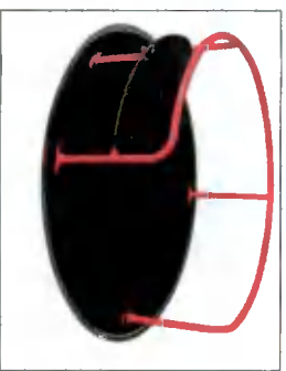
3: Wheelchair carousel Provider: Kompan or similar Age Group: 2+ Play capacity: 8 Inclusive play: wheelchair