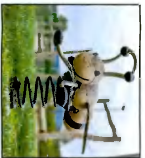
4: Bee springer Provider: Kompan or similar Age Group: 3+ Materials: Robinia treated rubber, wood & steel