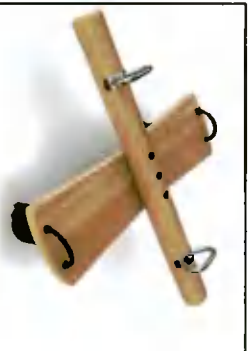
1: Butterfly seesaw Provider: Kompan or similar Age Group: 3-8 Materials: Robinia treated wood & steel

To be read with the Landscape Masterplan 21503-1-105 Rev. A