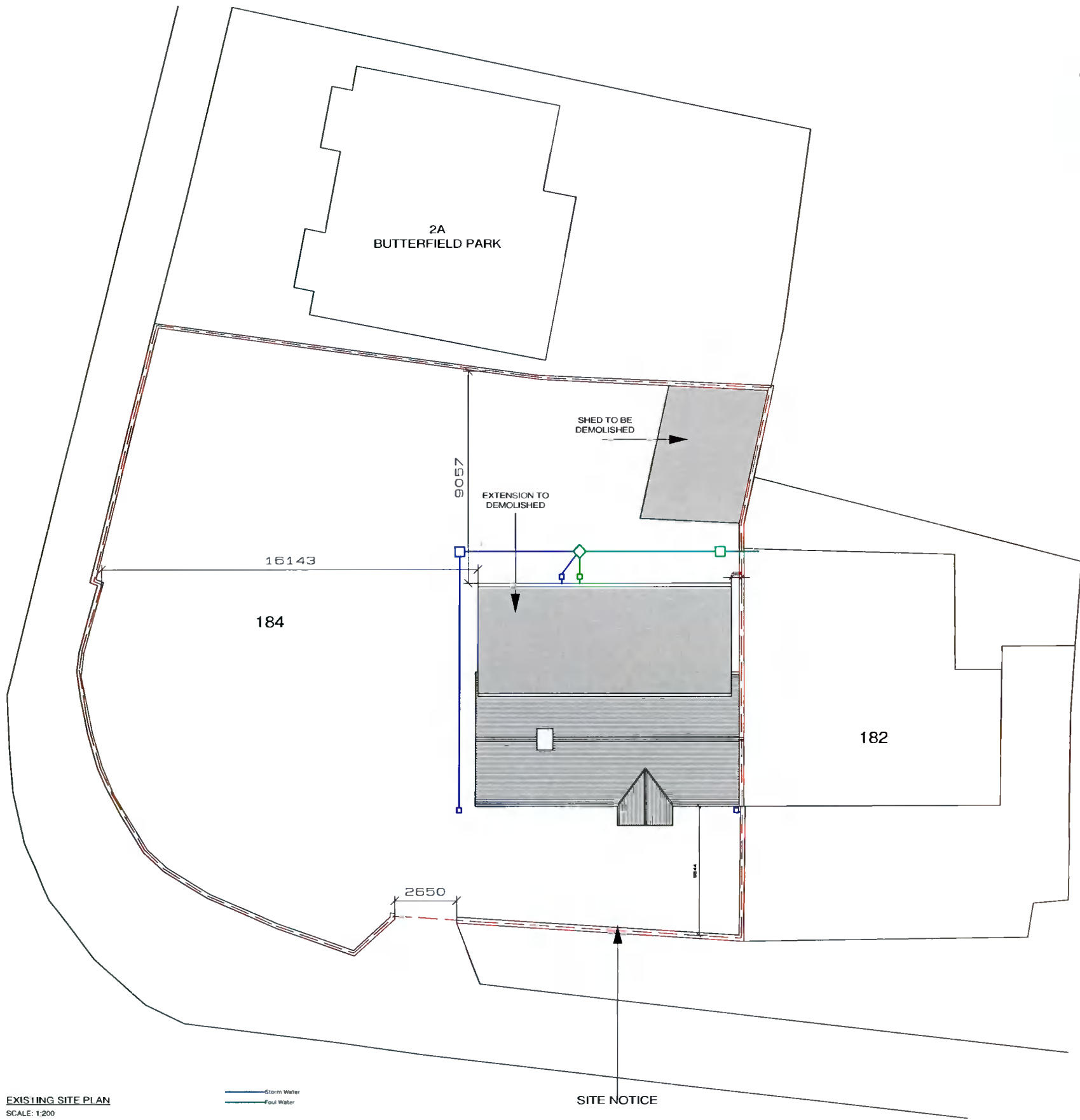
EXISTING SITE PLAN SCALE: 1:200