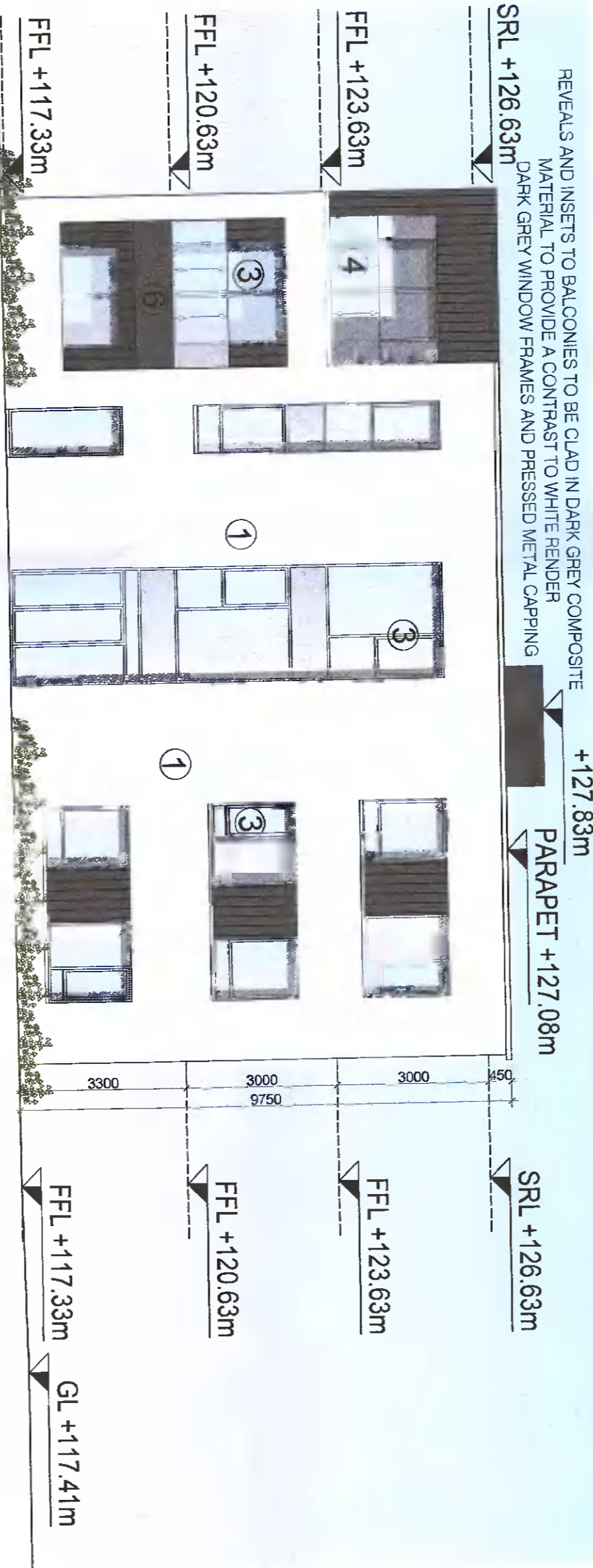
PROPOSED EAST ELEVATION - BLOCK A SCALE 1:100