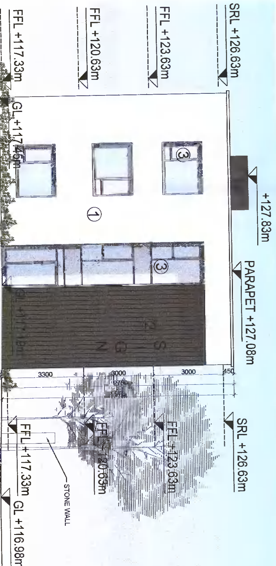
PROPOSED NORTH ELEVATION - BLOCK A SCALE 1:100