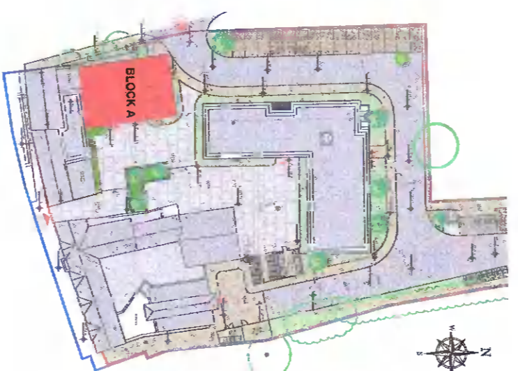
KEY PLAN SCALE 1:1000