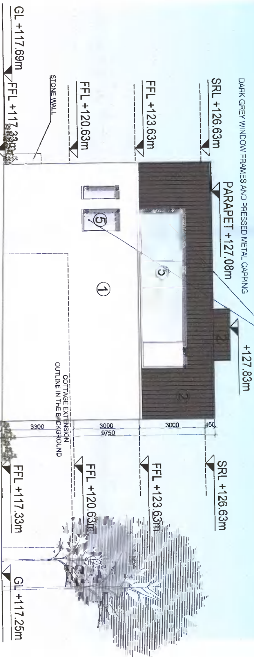
PROPOSED SOUTH ELEVATION - BLOCK A SCALE 1:100

ALL GLAZING FACING COTTAGES AND ROAD TO BE OPAQUE WITH NO VIEWS/OVERLOOKING TO NEIGHBORING PROPERTIES GARDENS