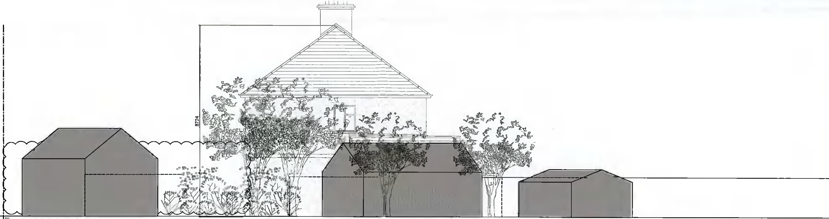
EXISTING SIDE CONTIGUOUS ELEVATION