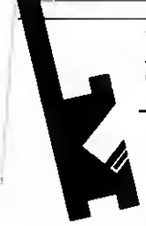
Site Plan with Roof Plan