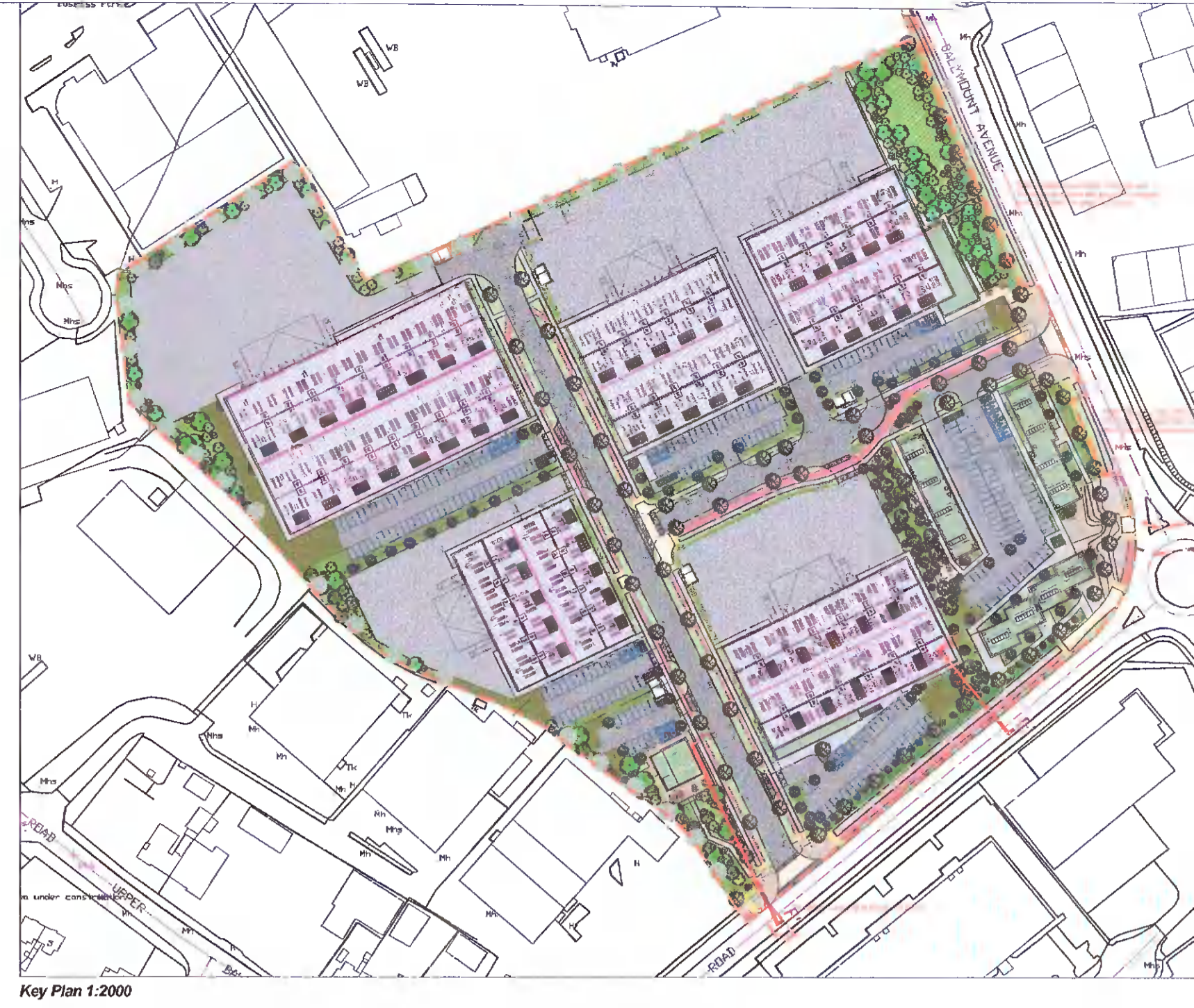
Key Plan 1:2000

Section F-F' South Boundary & Coffee Unit Entrance Scale 1:100