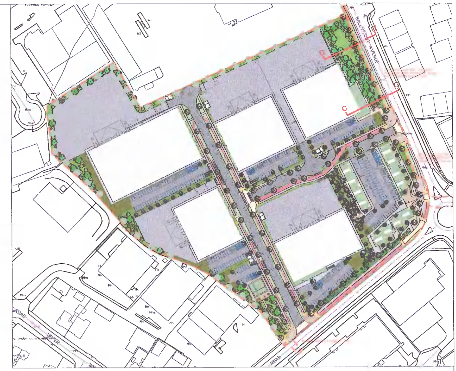
Key Plan 1:2000