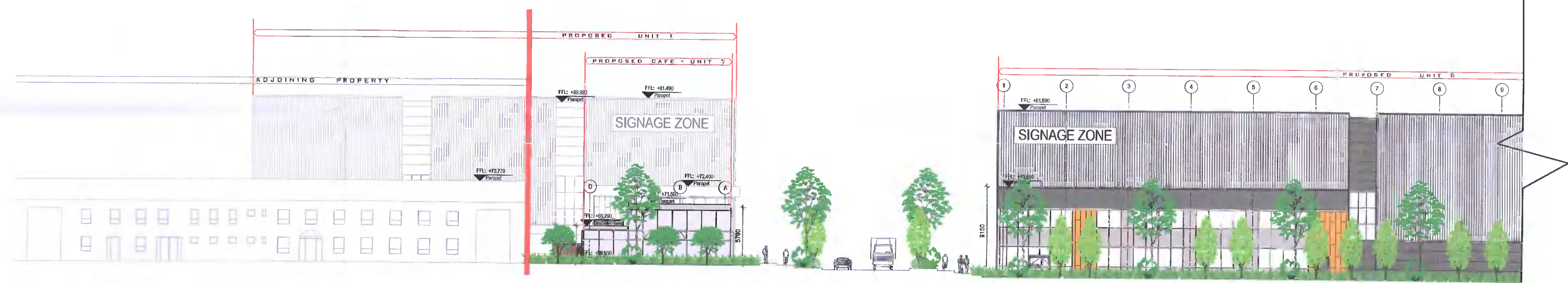
1 CONTEXTUAL ELEVATIONS-Part1 PA-401 Calmount Road Scale: 1:250