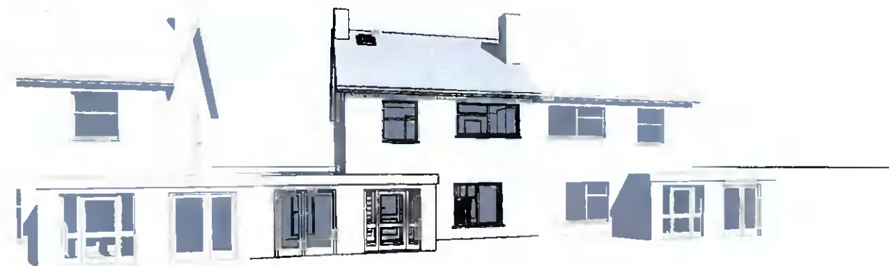
5 3D Perspective Front Existing