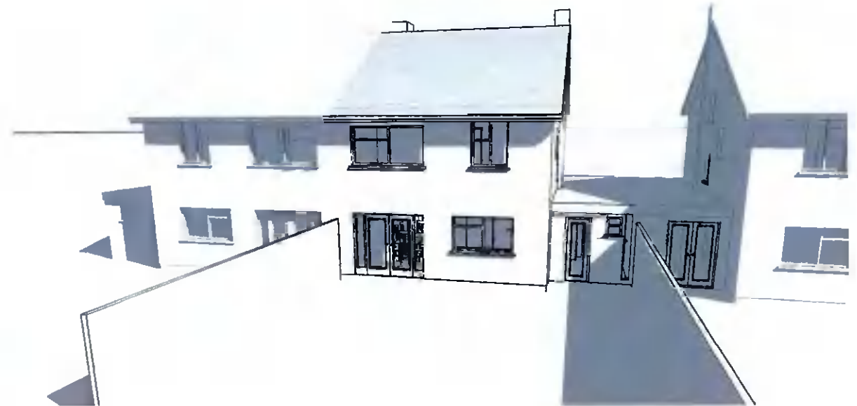
3 3D Rear Existing