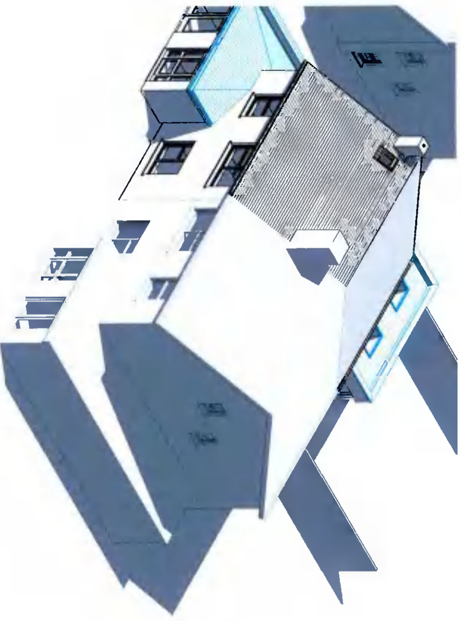
3 3D Ortho 02