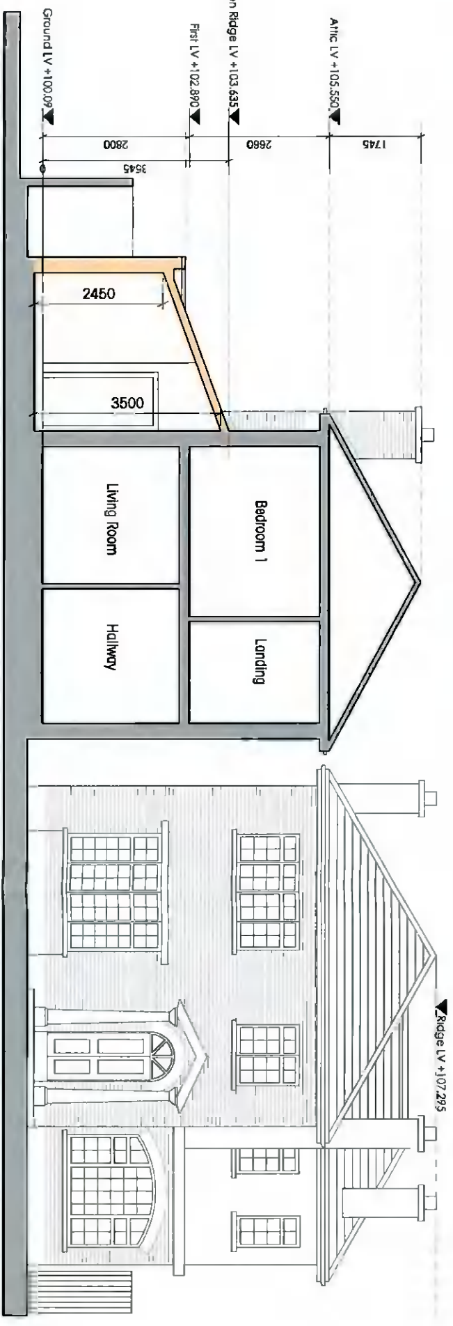
Proposed Extension Ridge LV +103.635