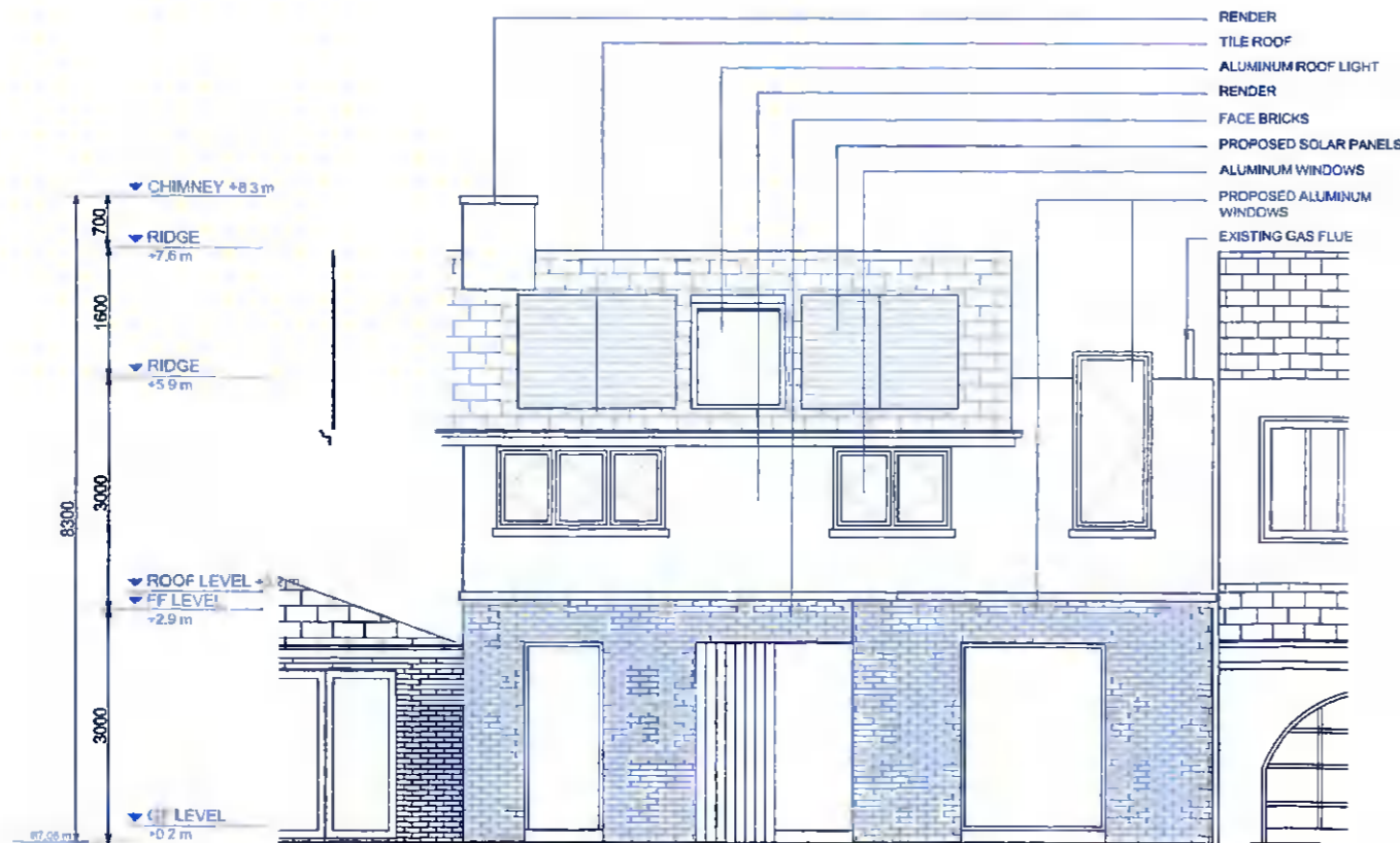
PROPOSED FRONT (WEST) ELEVATION