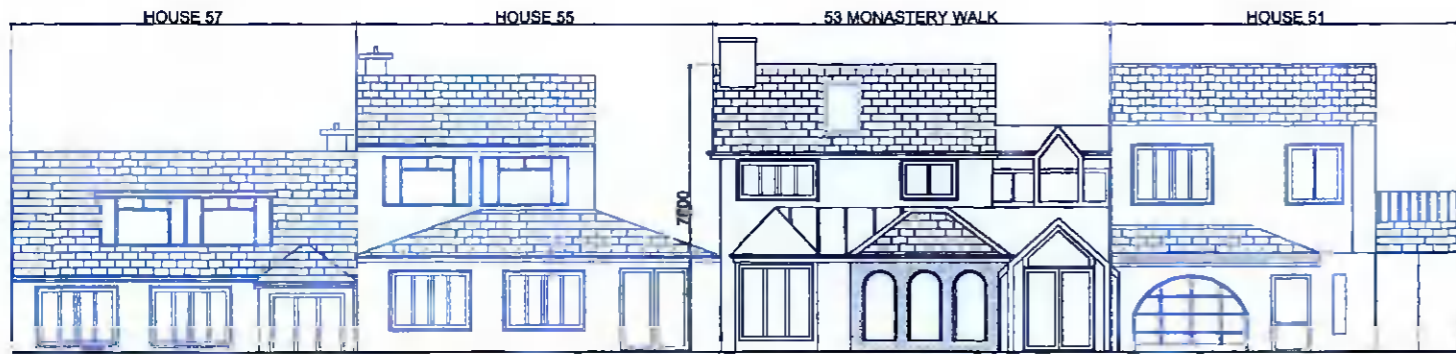
EXISTING WEST ELEVATION (FRONT VIEW)