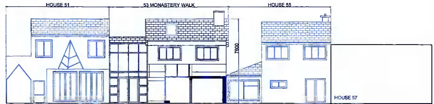
EXISTING EAST CONTEXT ELEVATION (REAR VIEW - B-B')