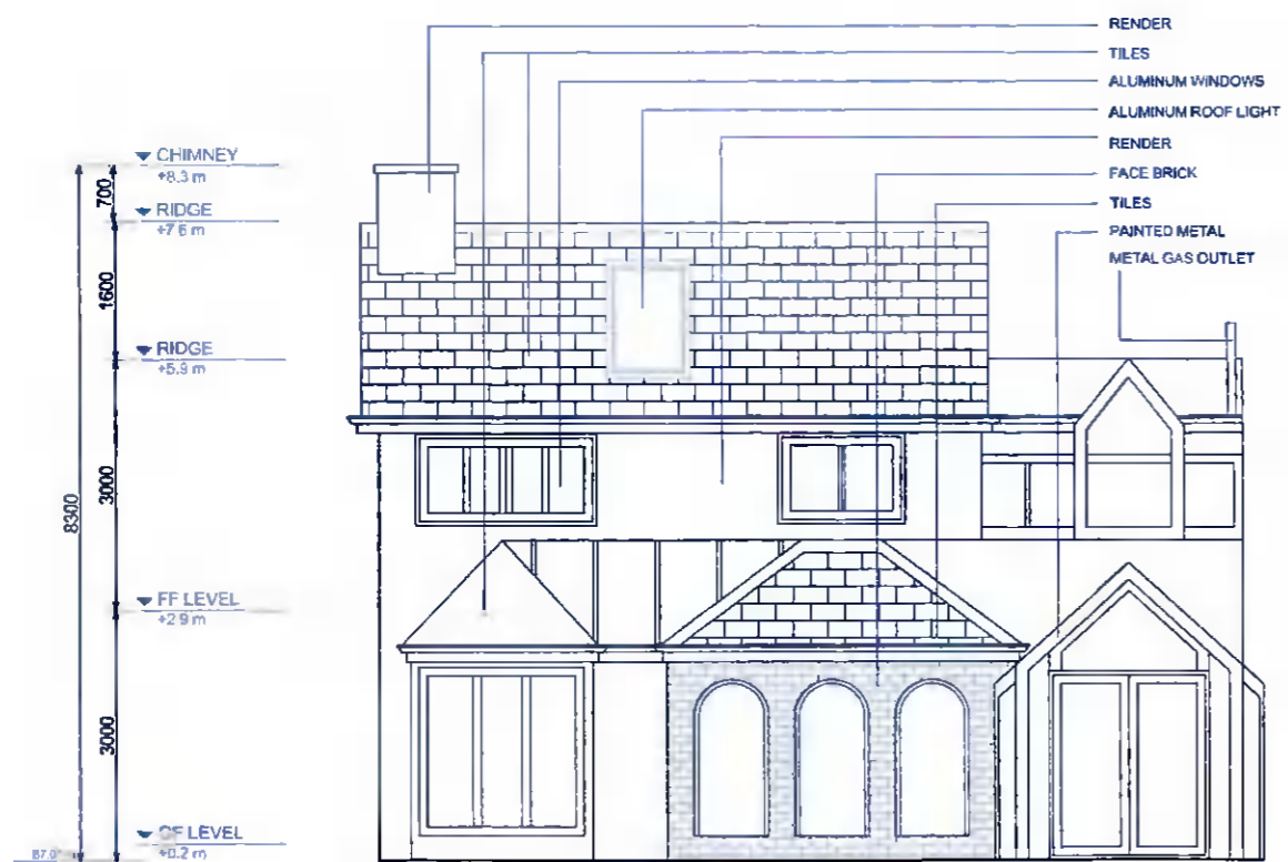
EXISTING WEST ELEVATION (FRONT VIEW)