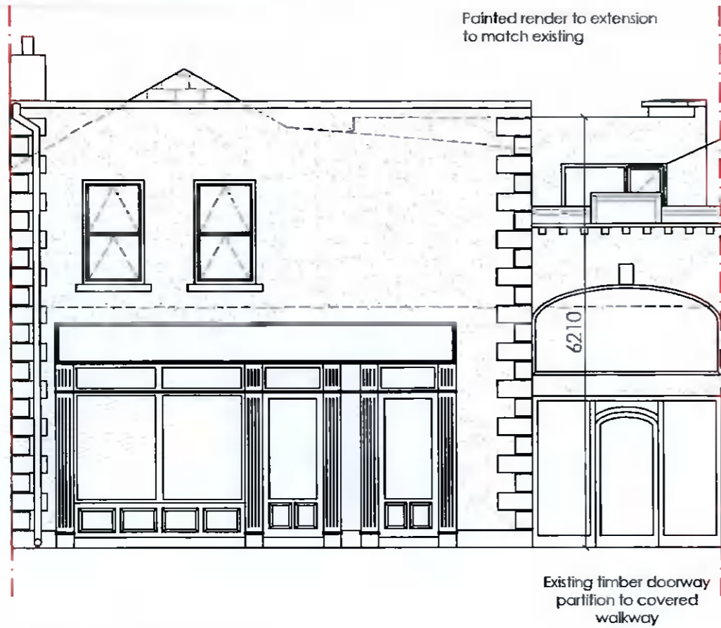
Proposed Front Elevation Scale 1:75