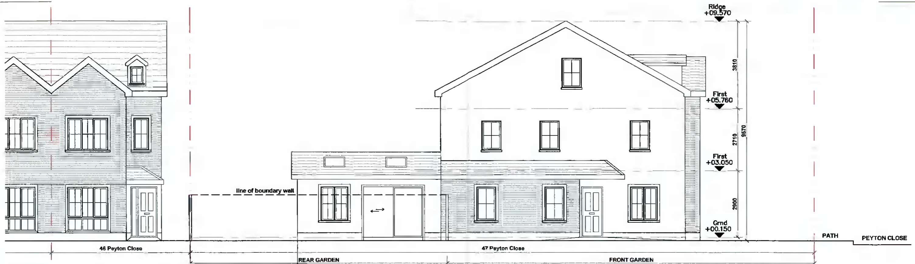
Proposed Side Contiguous Elevation Scale 1/100

WHERE ACCESS IS RESTRICTED ASSUMPTIONS HAVE BEEN MADE