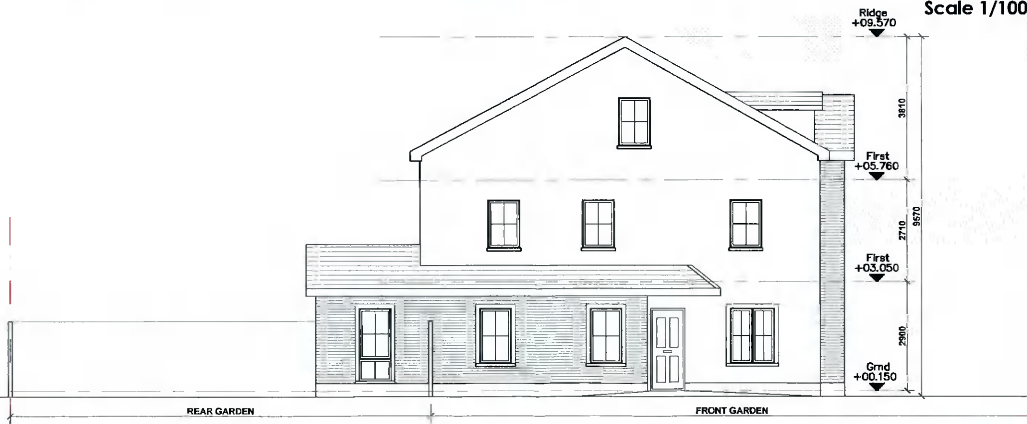
Existing Side Elevation Scale 1/100

Project Title: Single-storey extension to rear of existing dwelling at 47 Peyton Close, Rathcoole, Co. Dublin D24 N934