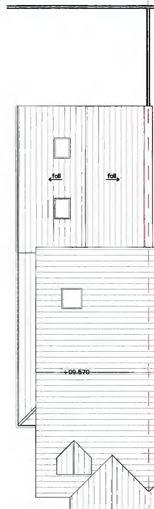
Proposed Roof Plan Scale 1/100

Project Title: Single-storey extension to rear of existing dwelling at 47 Peyton Close, Rathcoole, Co. Dublin D24 N934