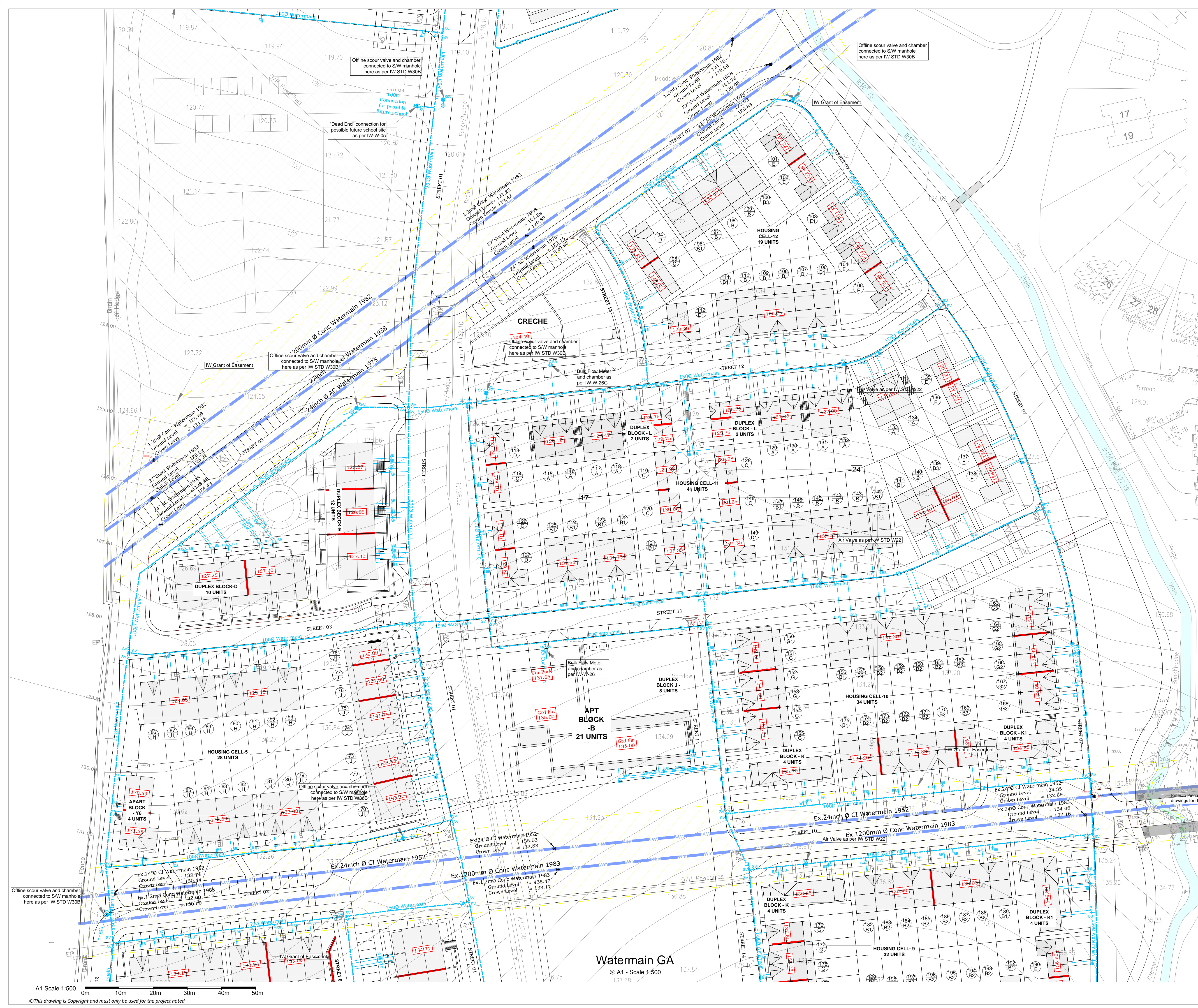
Watermain GA @ A1 - Scale 1:500