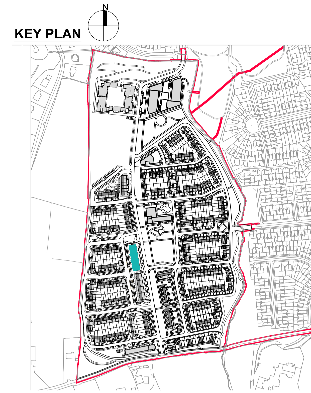
DUPLEX BLOCK C