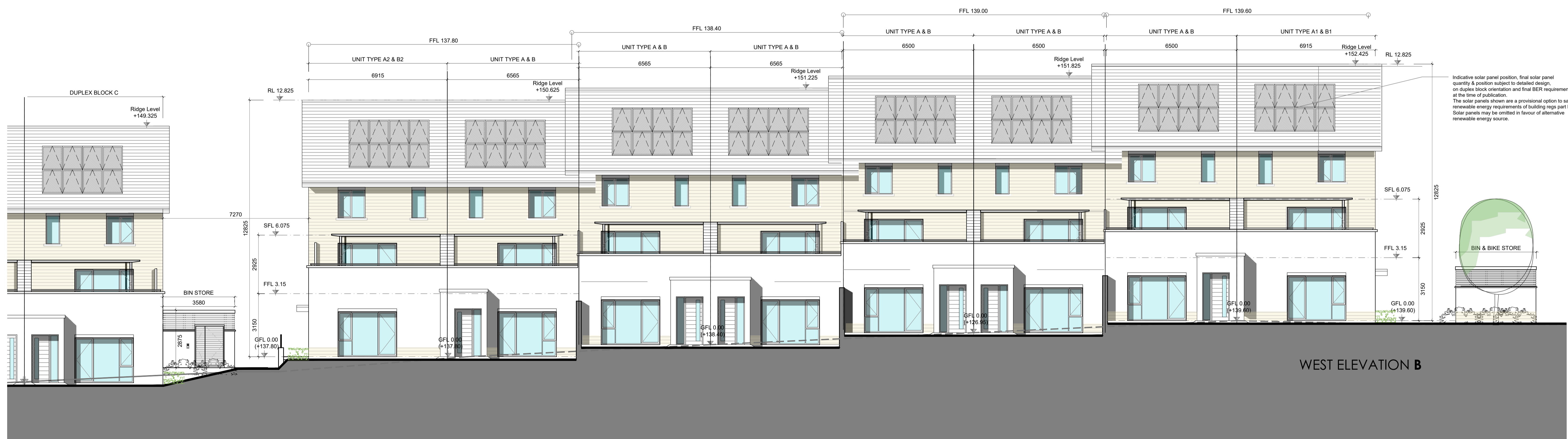
WEST ELEVATION B