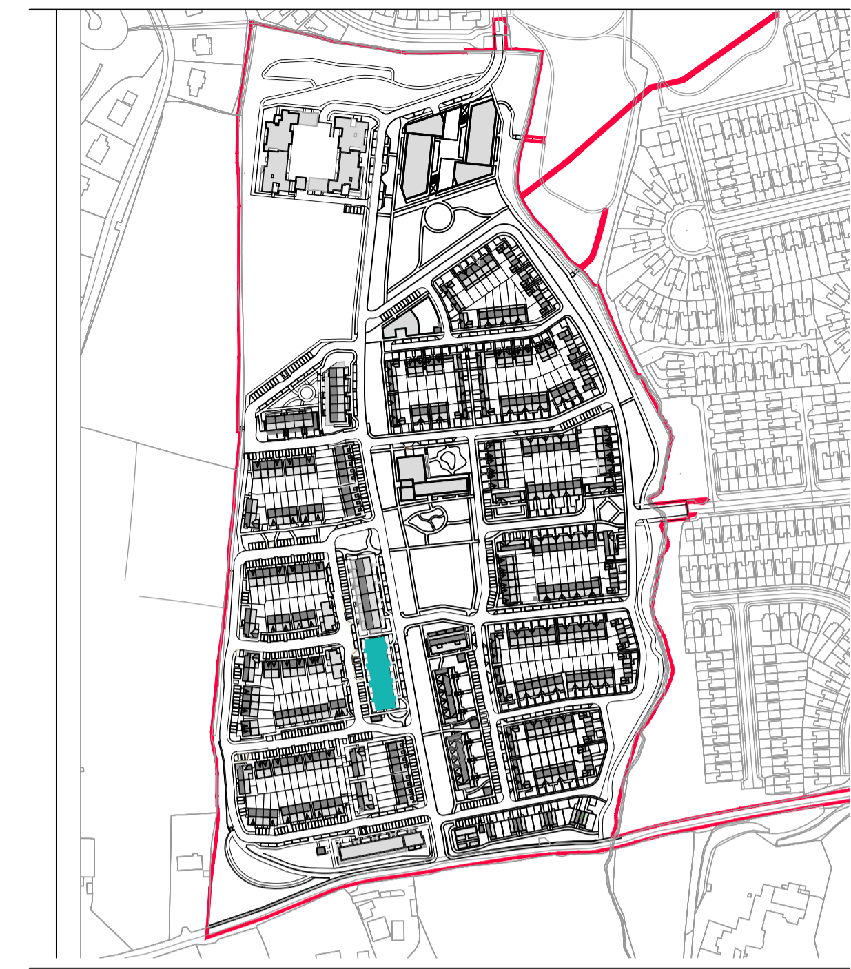
DUPLEX BLOCK B