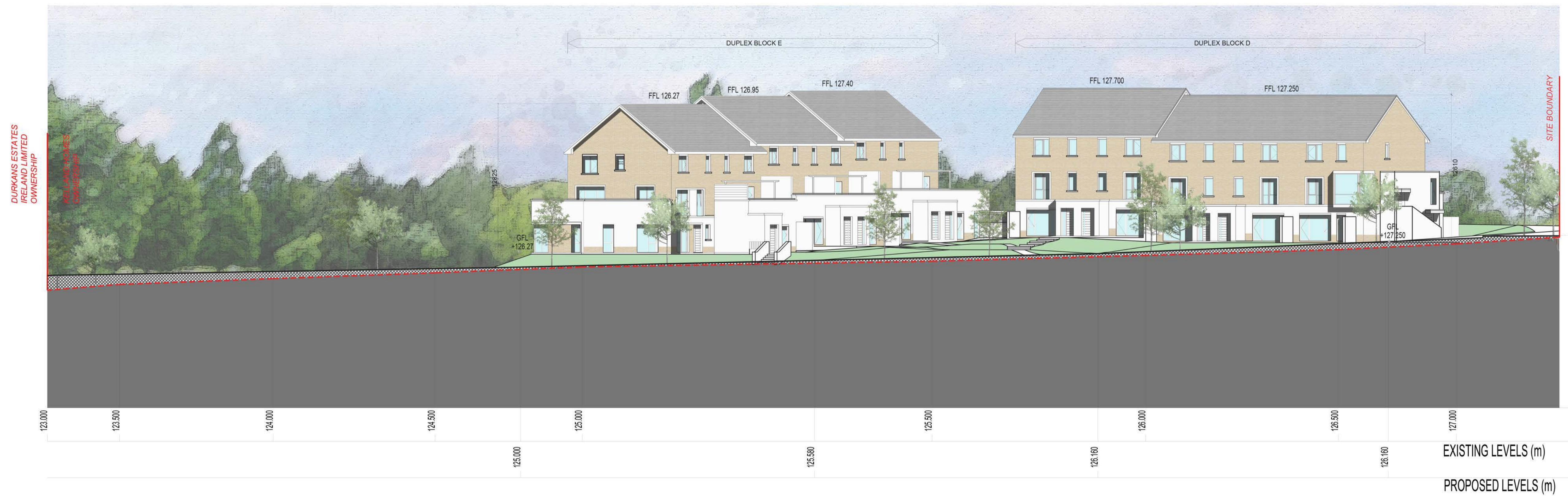
SECTION E-E - Scale 1:200