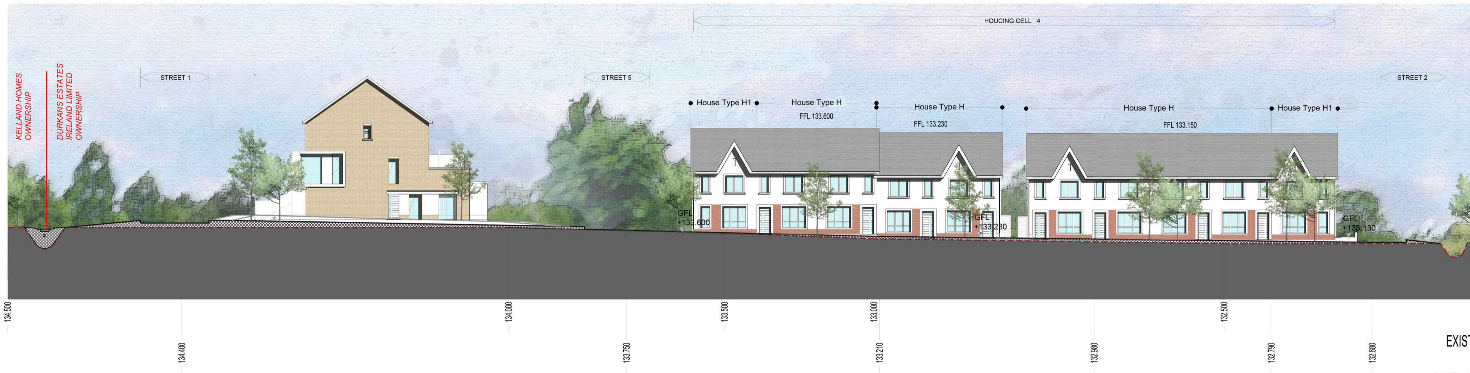
SECTION F-F - Scale 1:200