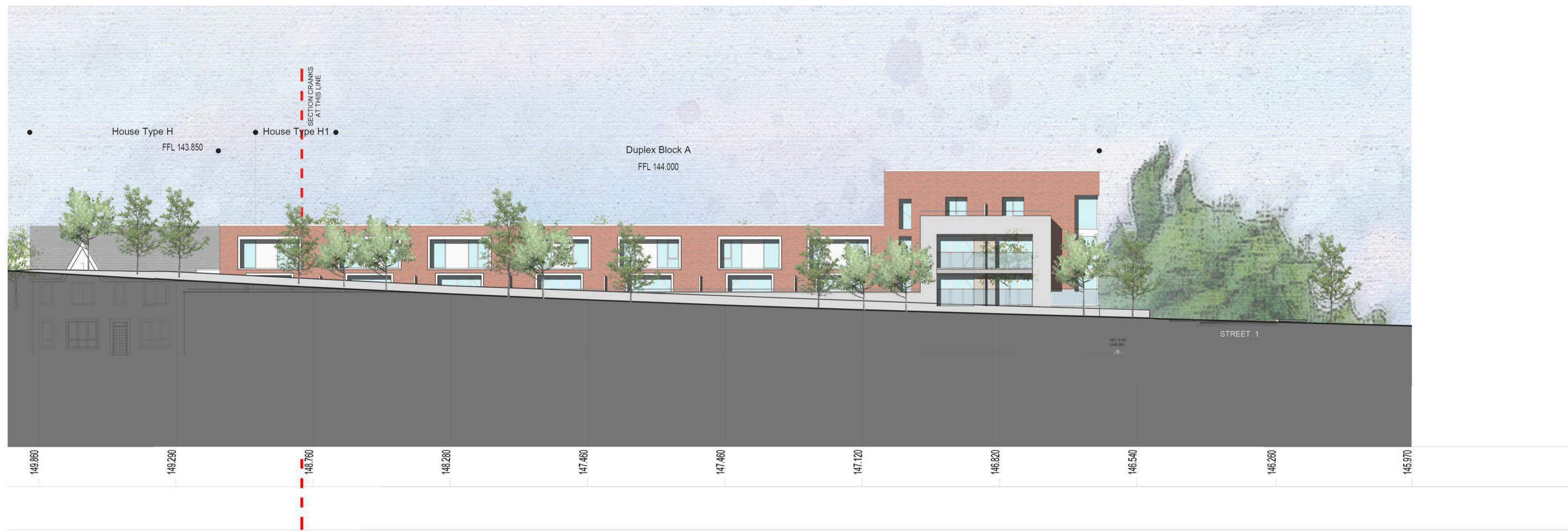
SECTION D-D (PART 2) - Scale 1:200

NOTES: DO NOT SCALE FROM DRAWINGS. WORK TO FIGURED DIMENSIONS ONLY. ARCHITECT TO BE NOTIFIED OF ALL DISCREPANCIES.