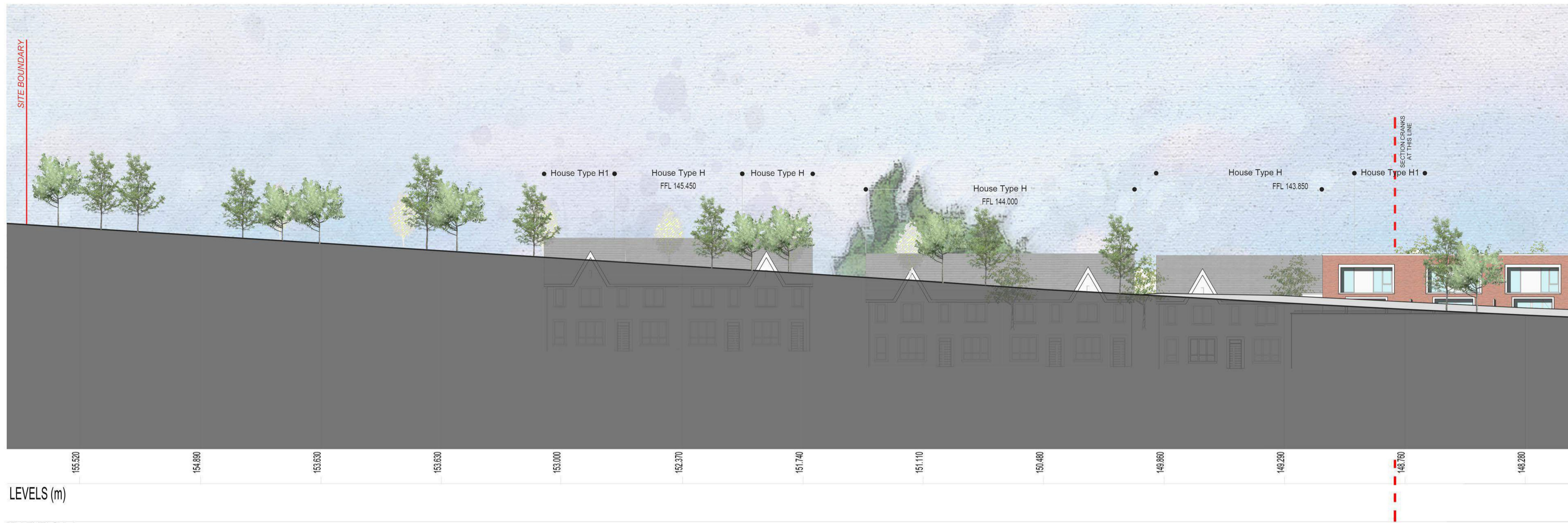
LEVELS (m) ED LEVELS (m) SECTION D-D (PART 1) - Scale 1:200