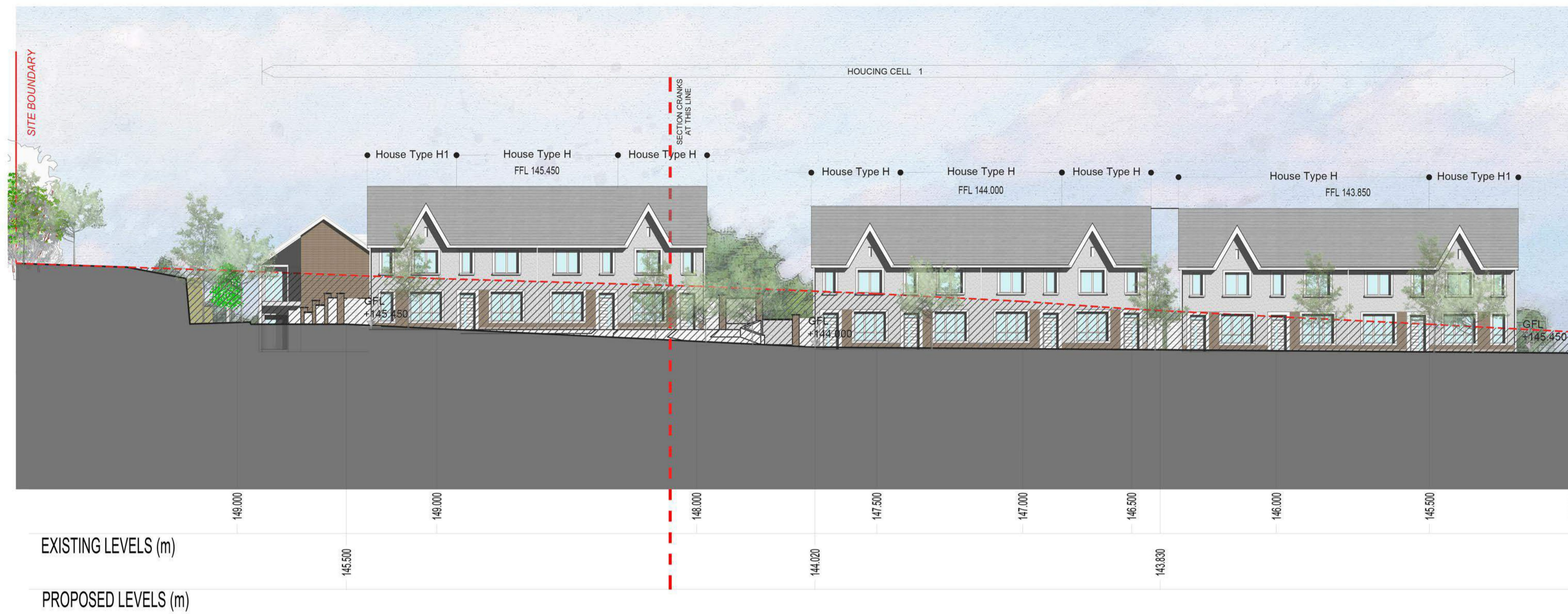
SECTION C-C (PART 1) - Scale 1:200