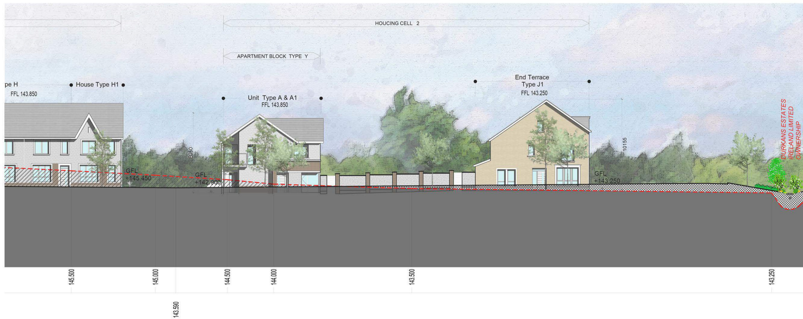
SECTION C-C (PART 2) - Scale 1:200