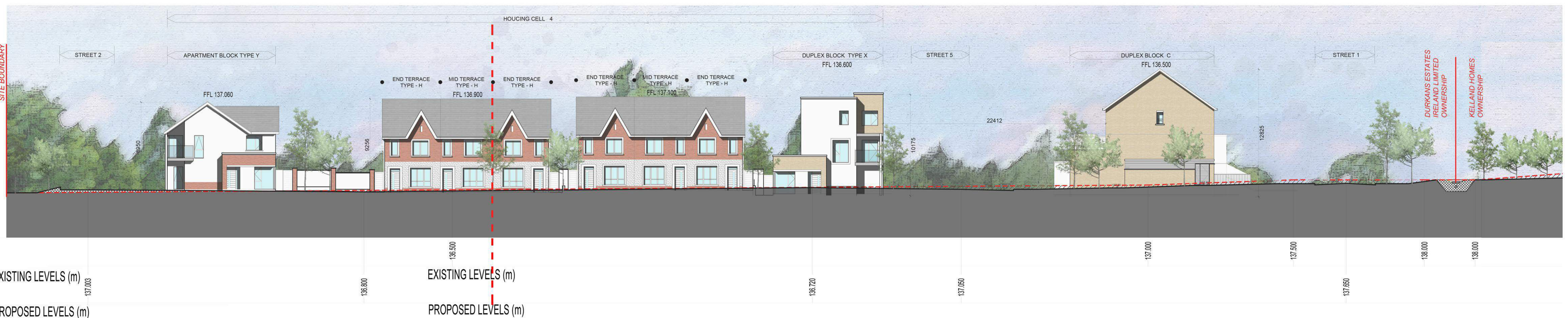
SECTION A-A - Scale 1:200