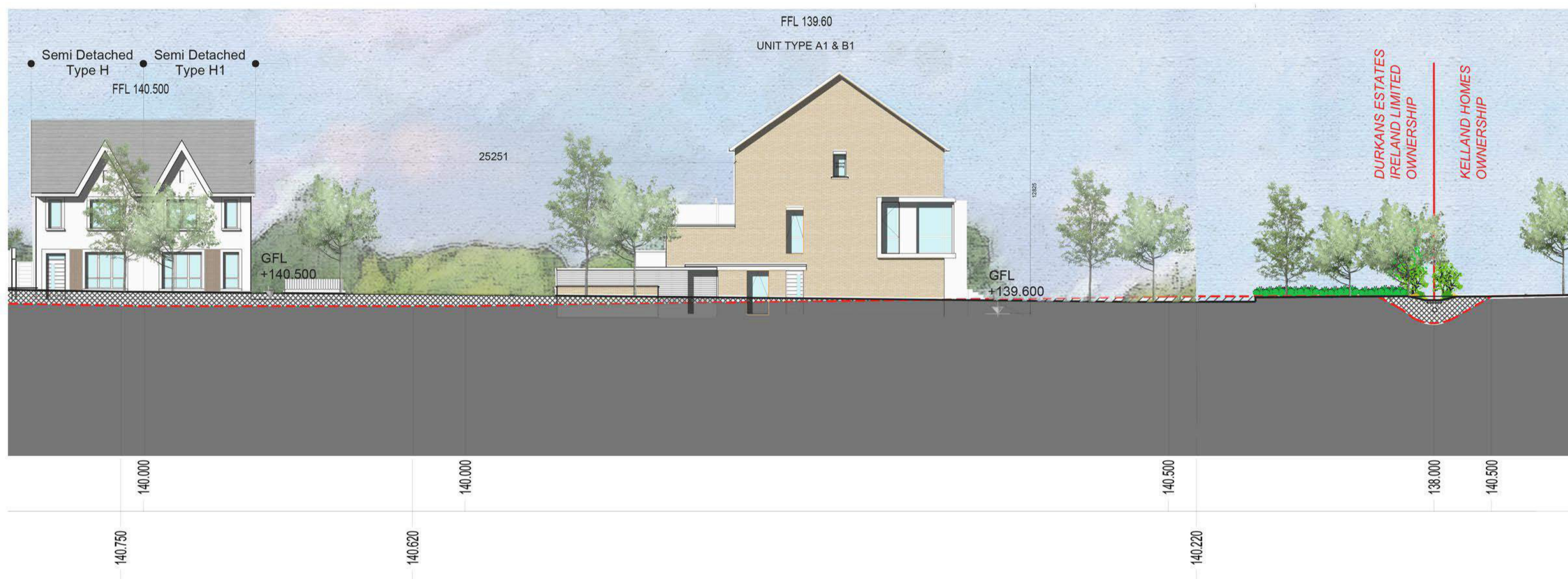
SECTION B-B (PART 2) - Scale 1:200