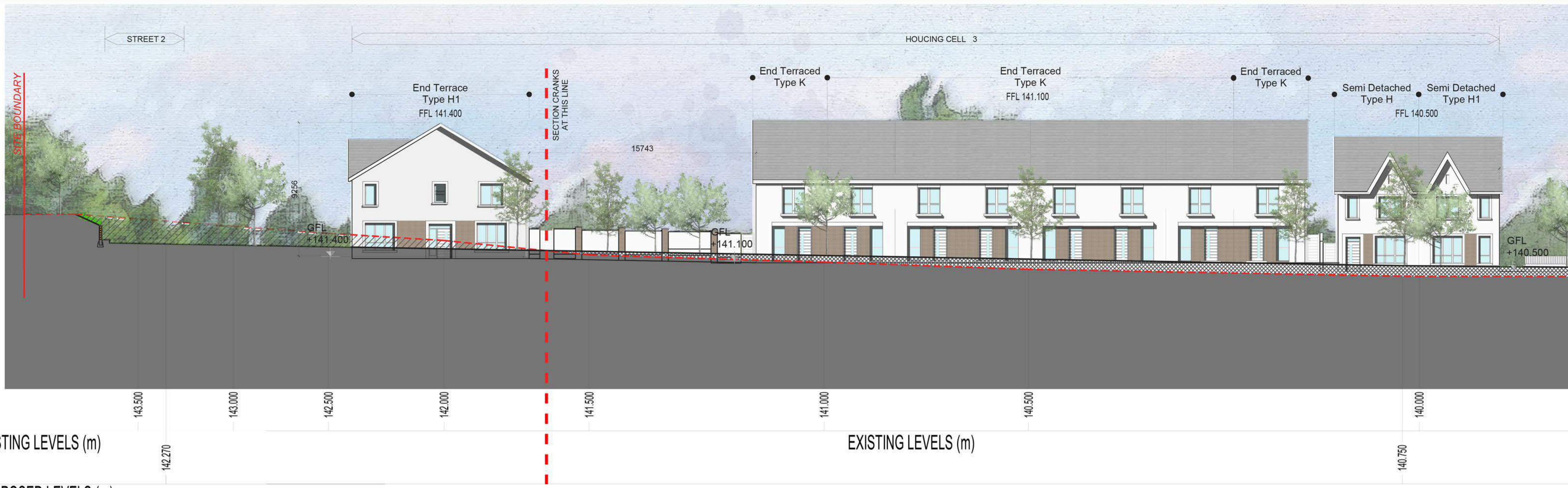
SECTION B-B (PART 1) - Scale 1:200