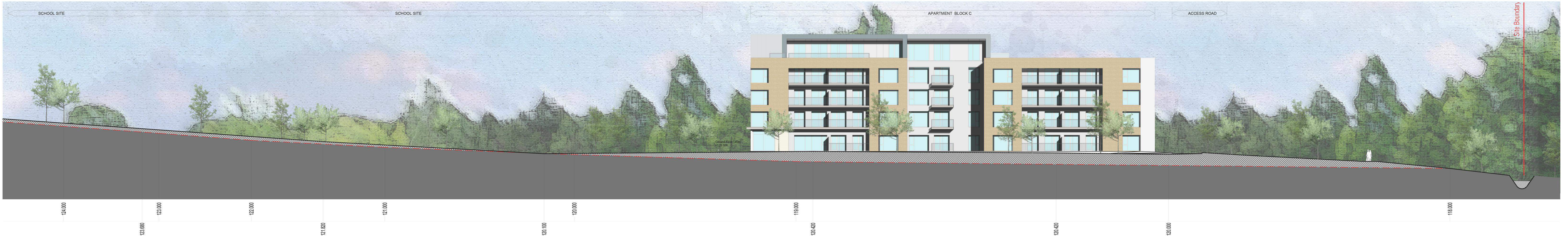
LONG SECTION Z-Z (PART 3) - LOOKING WEST Scale 1:200