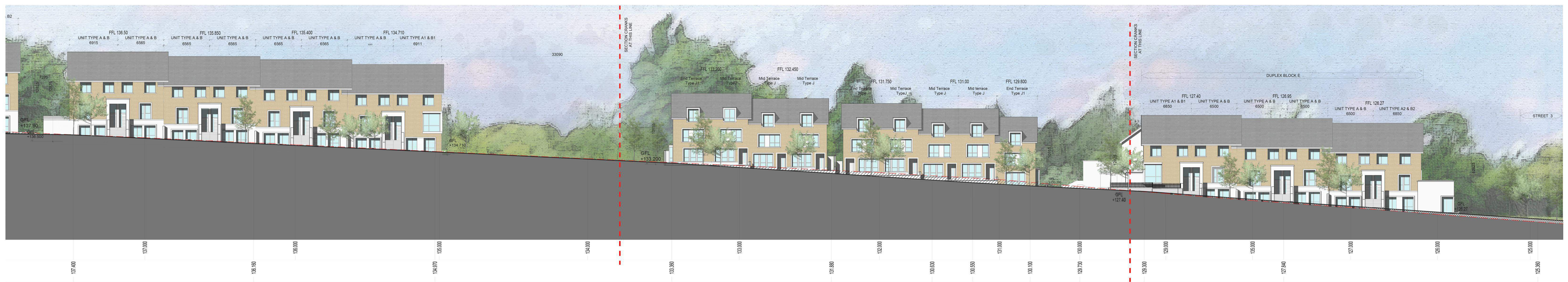
LONG SECTION Z-Z (PART 2) - LOOKING WEST Scale 1:200