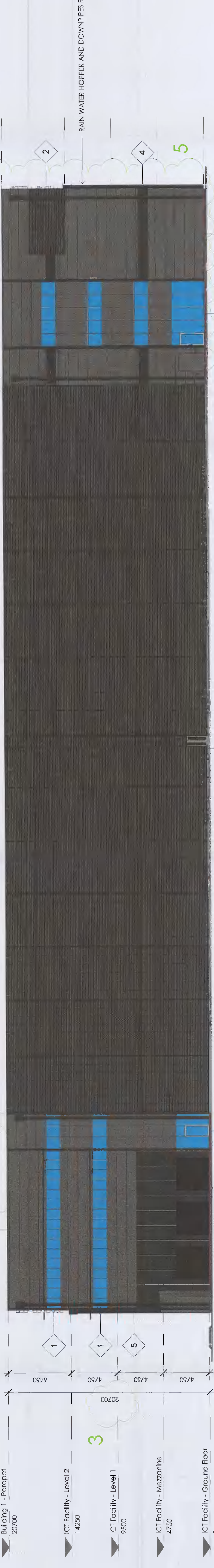
3 SOUTH ELEVATION - PROPOSED 1:200