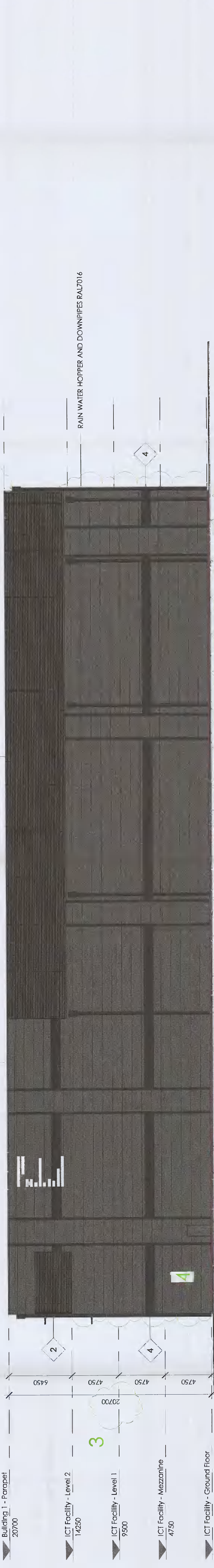
2 EAST ELEVATION - PROPOSED 1:200