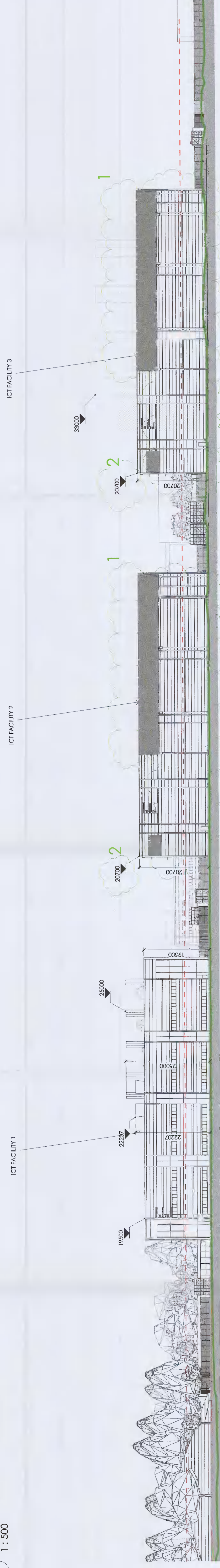
2 Site Section 2 - Proposed 1 : 500