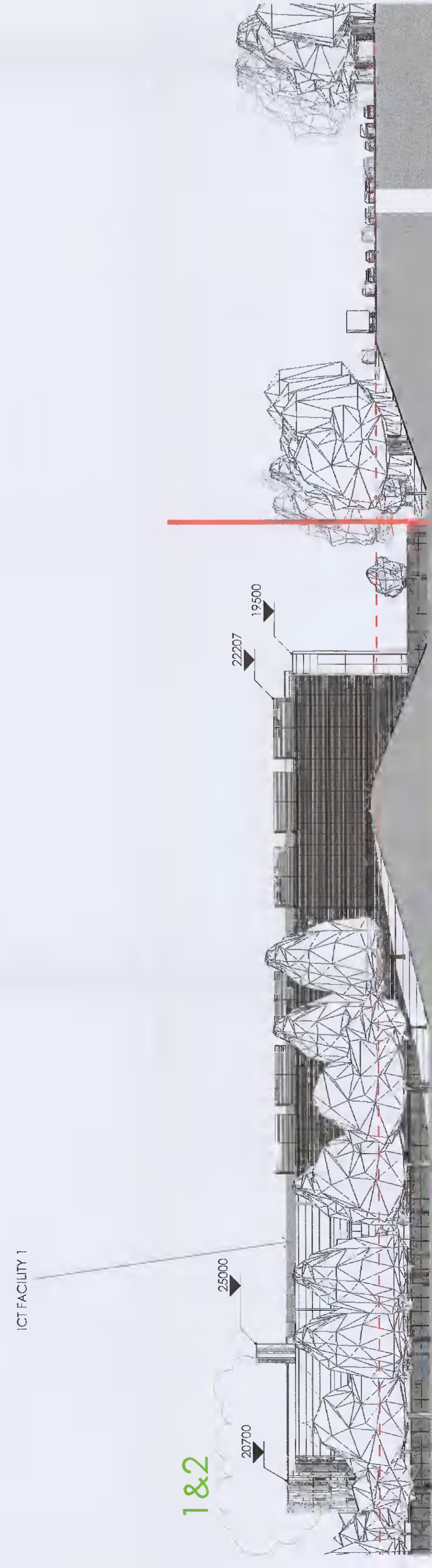
3 Site Section 3 - Proposed 1 : 500

REVISIONS: 1. REMOVAL OF GENERATOR FLUES AND CENTRAL EXHAUST DUCTS 2. REVISIONS TO THE LAYOUT OF THE M50 ROAD 3. FACILITY TREATMENT UPDATES TO REFLECT INTERNAL LAYOUT CHANGES.