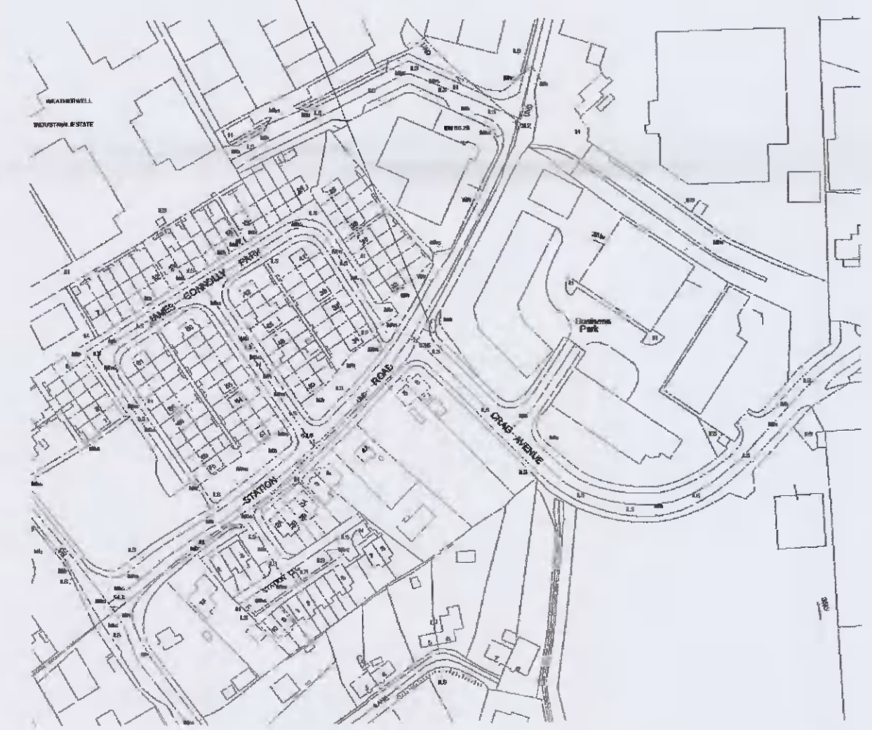
3 Site Location Map B 1 : 2500