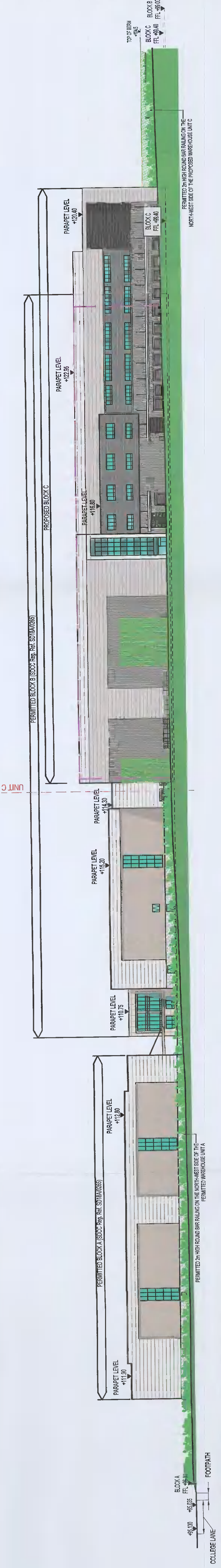
ELEVATION AA SCALE 1:500