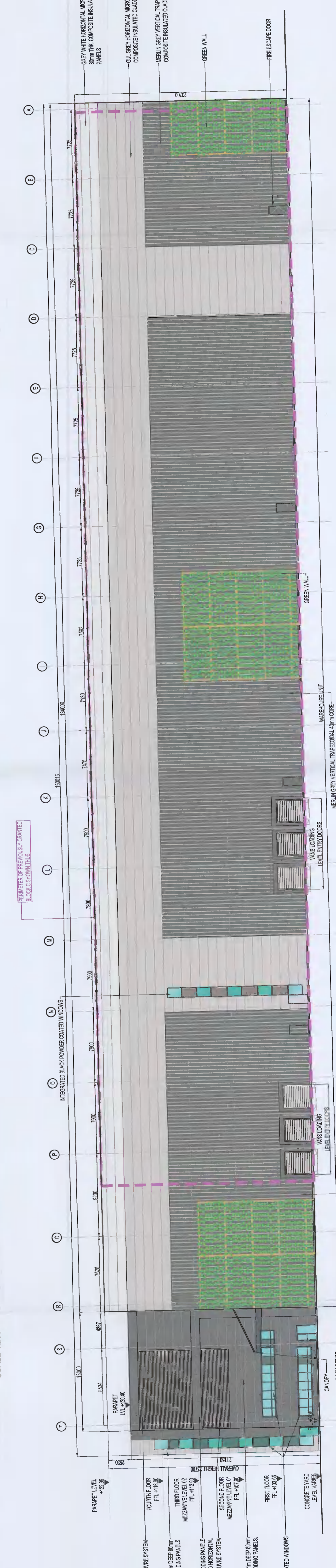
REAR (EASTERN) SCALE 1:200