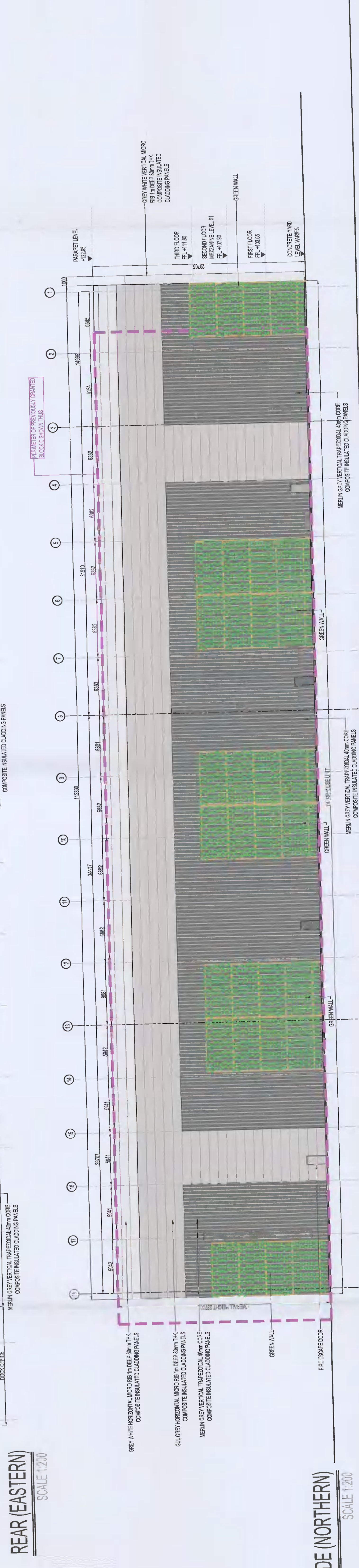
SIDE (NORTHERN) SCALE 1:200

PERMITTED DRAWING (PROVIDED FOR RECORD PURPOSES ONLY) SDCC GRANTED PLANNING REGISTER REFERENCE No. SD21A0200