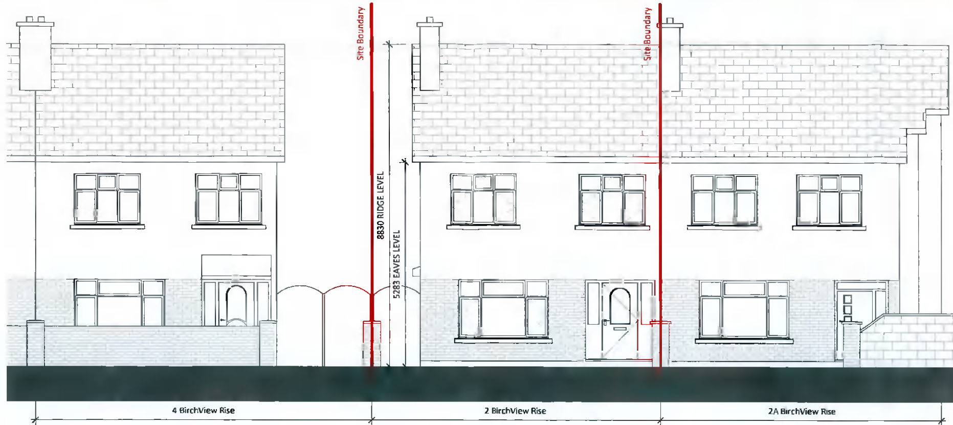
① Existing Front Contiguous Elevation 1 : 100