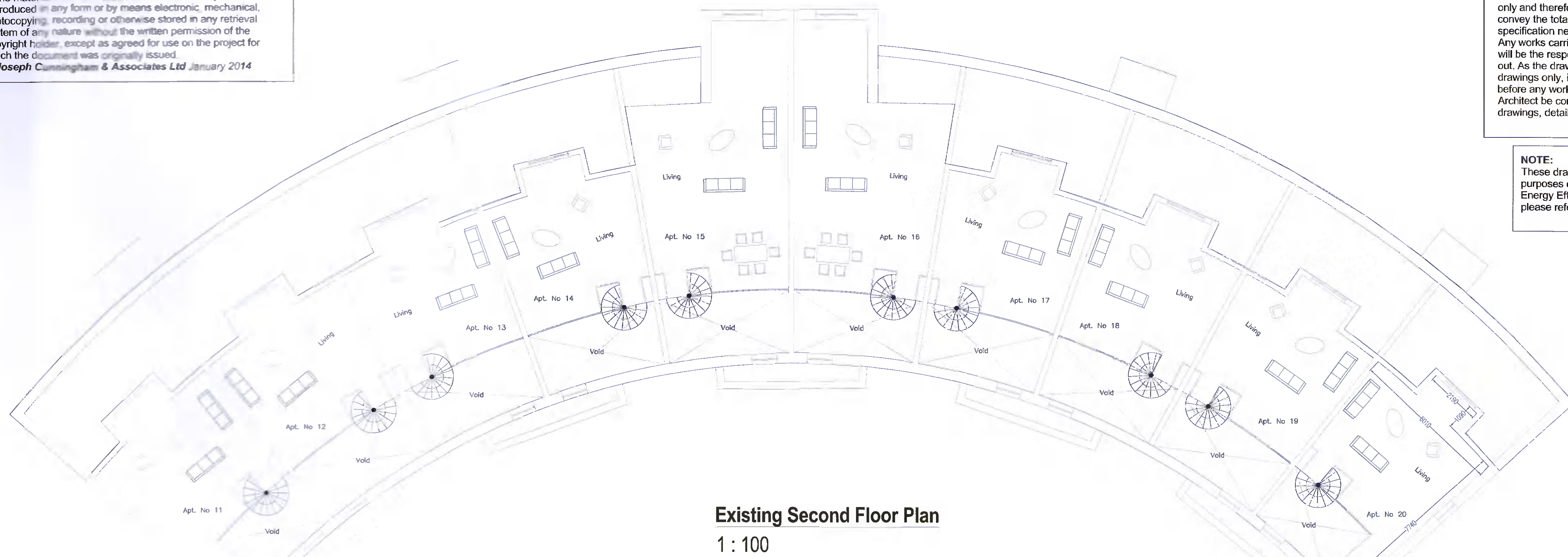
Existing Second Floor Plan 1 : 100

All materials used in connection with the works to comply with the Construction Products Regulation (EU) No. 305/2011 and the harmonised technical specification/standards that fall within the remit of the CPR No. 305/2011