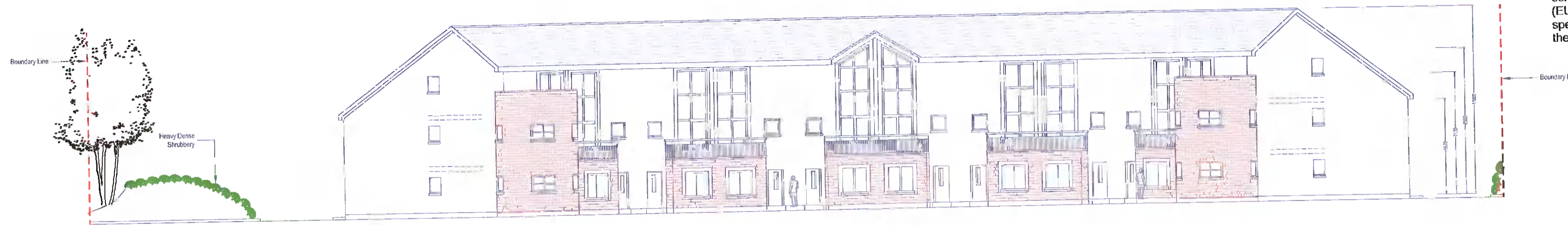
Existing Contiguous Front Elevation 1 : 200

All materials used in connection with the works to comply with the Construction Products Regulation (EU) No. 305/2011 and the harmonised technical specification/standards that fall within the remit of the CPR No. 305/2011