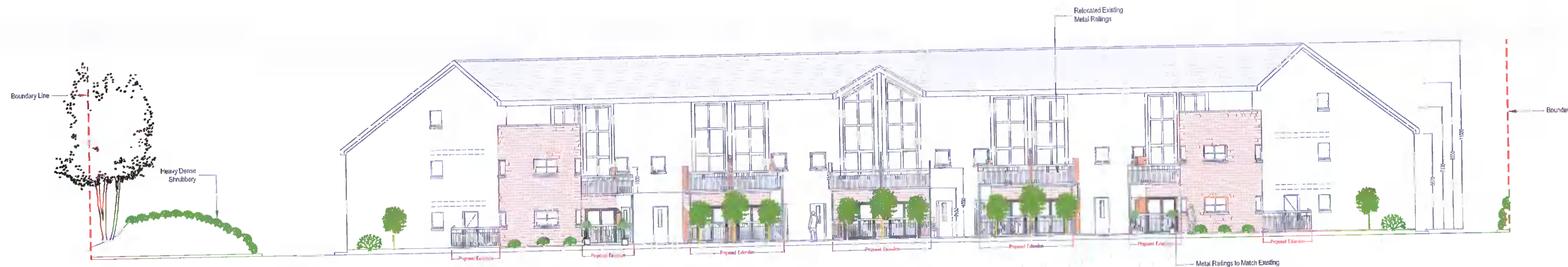
Proposed Contiguous Front Elevation 1 : 200

NOTE: It should be noted that this is a planning drawing only and therefore is limited in its capacity to convey the total information, details and specification necessary to complete the works. Any works carried out which is not covered here will be the responsibility of the person carrying it out. As the drawings are prepared as planning drawings only, it is strongly recommended that before any work commences the Engineer / Architect be consulted, in order that full working drawings, details and specification be prepared.