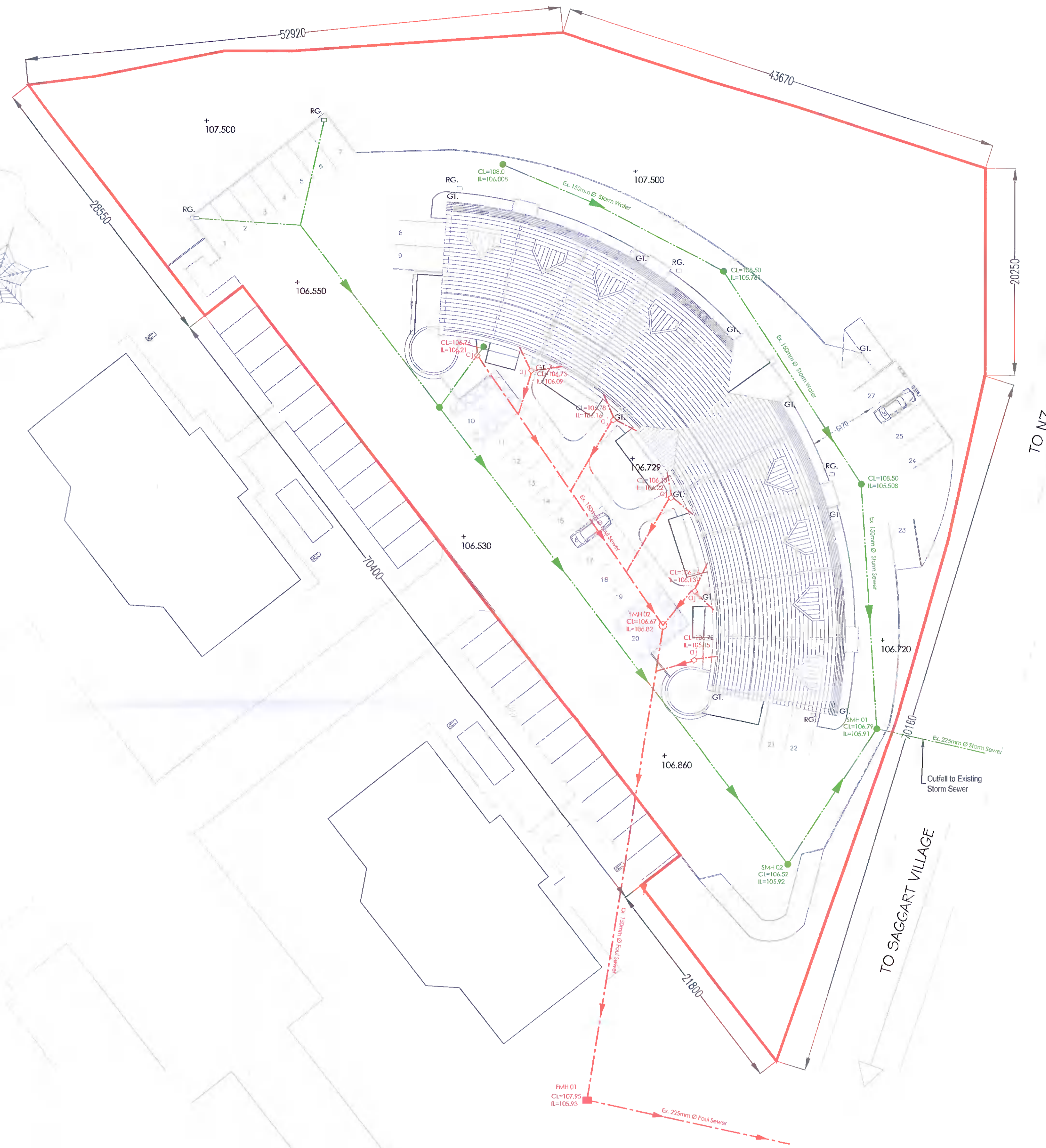
Existing Storm & Foul Layout 1 : 250

NOTE: It should be noted that this is a planning drawing only and therefore is limited in its capacity to convey the total information, details and specification necessary to complete the works. Any works carried out which is not covered here will be the responsibility of the person carrying it out. As the drawings are prepared as planning drawings only, it is strongly recommended that before any work commences the Engineer / Architect be consulted, in order that full working drawings, details and specification be prepared.