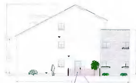
Proposed Side Elevation ~ (West) 1 : 200