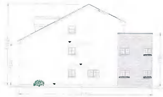
Existing Side Elevation ~ (West) 1 : 200