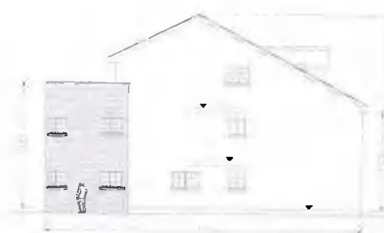
Existing Side Elevation ~ (South) 1 : 200