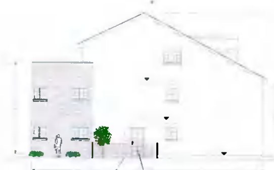
Proposed Side Elevation ~ (South) 1 : 200

NOTE: It should be noted that this is a planning drawing only and therefore is limited in its capacity to convey the total information, details and specification necessary to complete the works. Any works carried out which is not covered here will be the responsibility of the person carrying it out. As the drawings are prepared as planning drawings only, it is strongly recommended that before any work commences the Engineer / Architect be consulted, in order that full working drawings, details and specification be prepared.