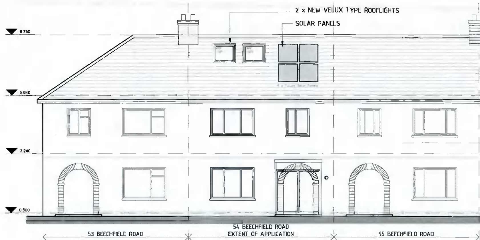
01 FRONT ELEVATION - PROPOSED SCALE 1:100