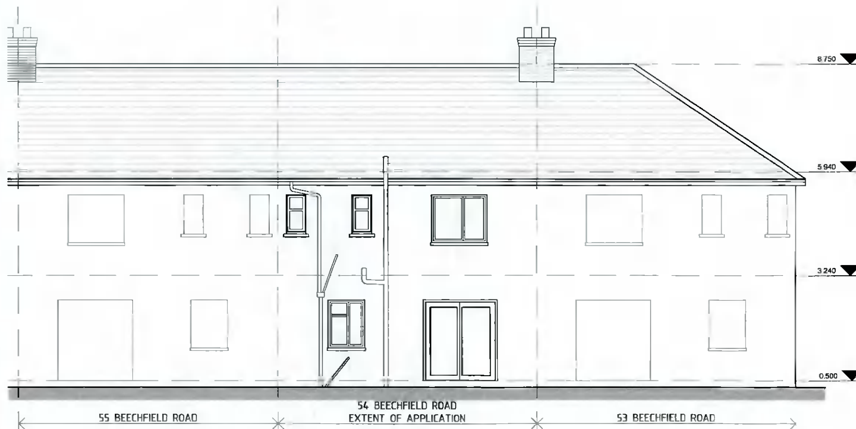
01 REAR ELEVATION SCALE 1:100