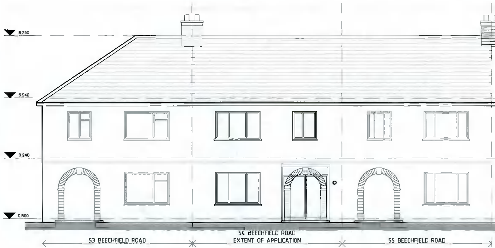
01 FRONT ELEVATION SCALE 1:100