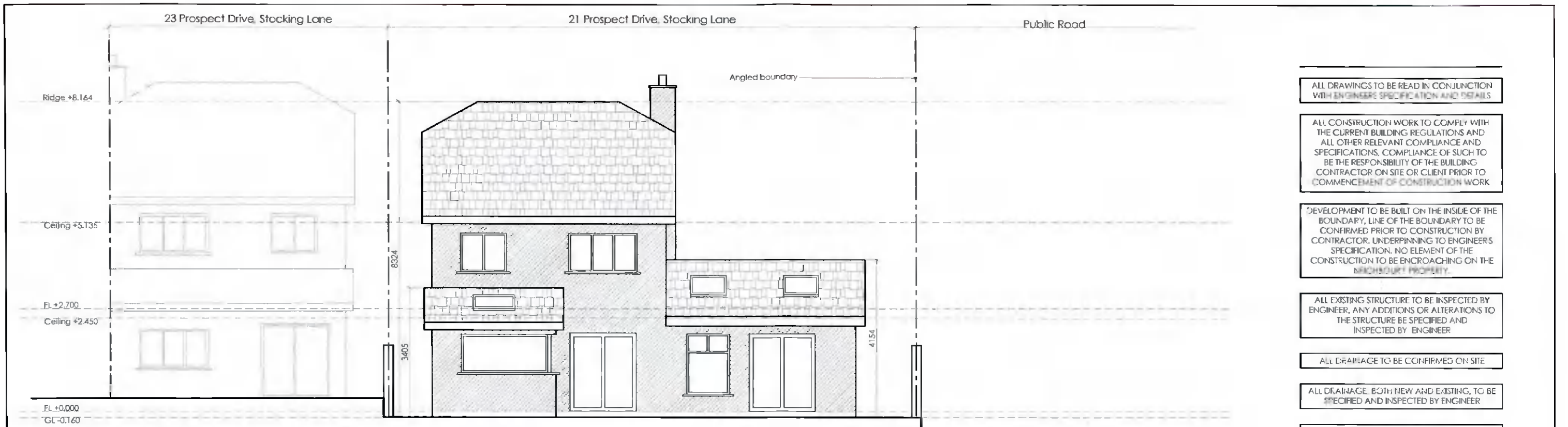
Existing Rear Contiguous Elevation [East] scale 1:100 @ A3