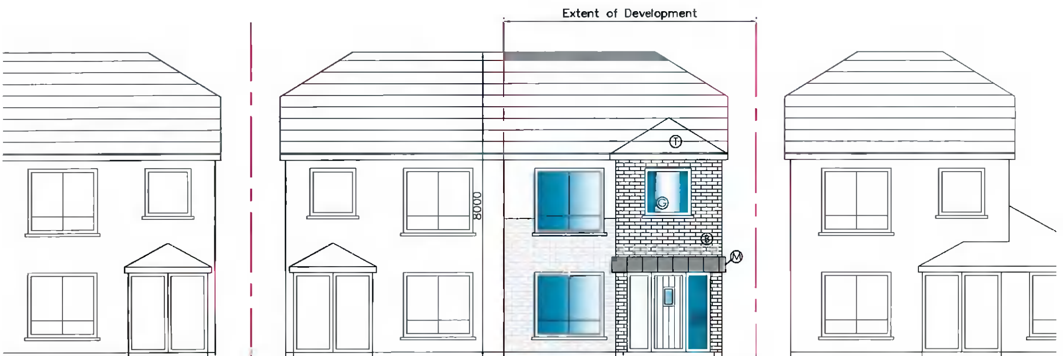
Proposed Contiguous Front Elevation Scale: 1/100